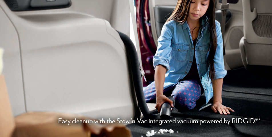
Easy cleanup with the Stow 'n Vac integrated vacuum powered by RIDGID®.*