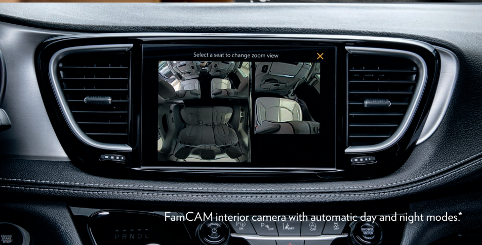
FamCAM interior camera with automatic day and night modes.*