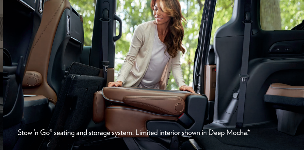
Stow 'n Go® seating and storage system. Limited interior shown in Deep Mocha.*