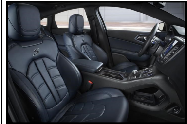
2015 Chrysler 200S Ambassador Blue interior

Also: "The 2015 Chrysler 200 offers the most available safety features in the mid-size sedan segment."