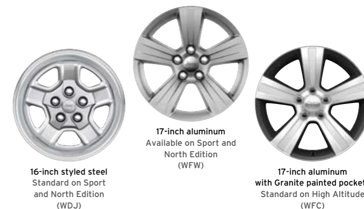
16-inch styled steel Standard on Sport and North Edition (WDJ)