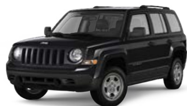
Cloth – Light Pebble Beige (shown below) Standard on Sport