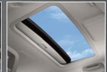
Nine Boston Acoustics speakers, including two liftgate speakers, and a sunroof are available in the Sun/Sound Group.