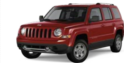
Cloth – Dark Slate Grey (shown below) Standard on North Edition