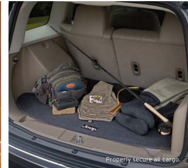
Properly secure all cargo.