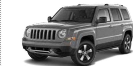
Leather-faced – Dark Slate Grey with Light Slate Grey accent stitching (shown below) Standard on High Altitude