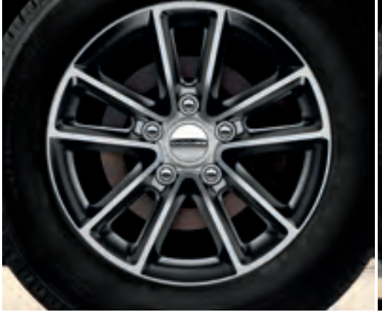
17-INCH ALUMINUM WITH GLOSS BLACK POCKETS Standard on Blacktop Package