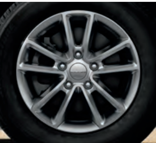
17-INCH SATIN CARBON ALUMINUM Standard on R/T (WGB)