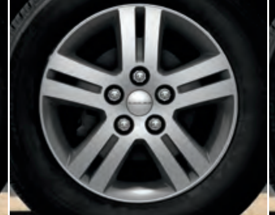
17-INCH ALUMINUM Standard on Crew and Crew Plus (WGF)