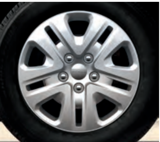
17-INCH STEEL Standard on CVP and SXT (W7A)