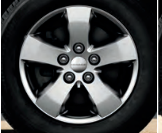
17-INCH ALUMINUM Standard on SE Plus, Optional on SXT (WFJ)