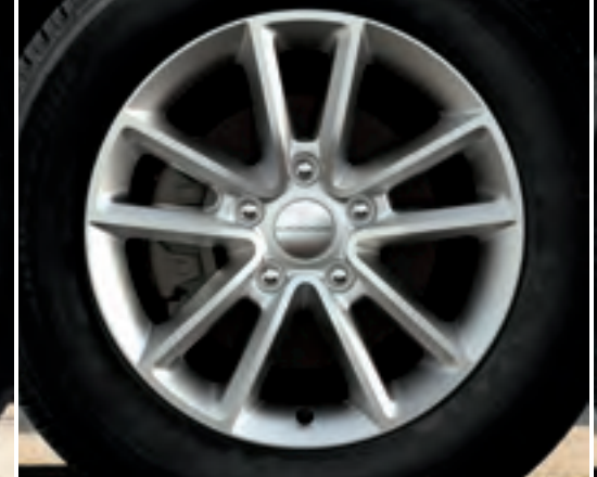
17-INCH ALUMINUM Standard on SXT Plus (WGH)