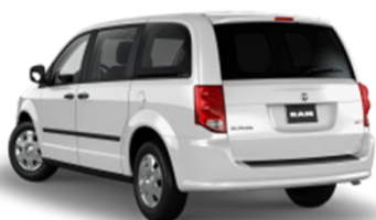
All Window Option (GC4)