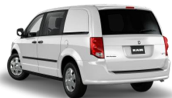
Side Door Window Option (GC3)