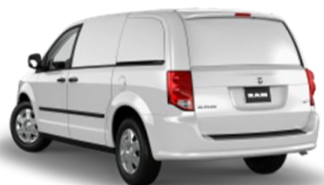
Standard Privacy Panel