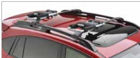
J-style carrier folds down when not in use.