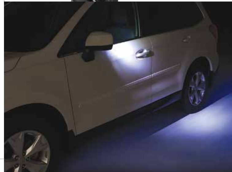
LED Light & Logo