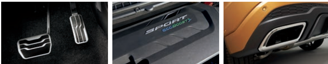
Electric Spice. Available equipment.