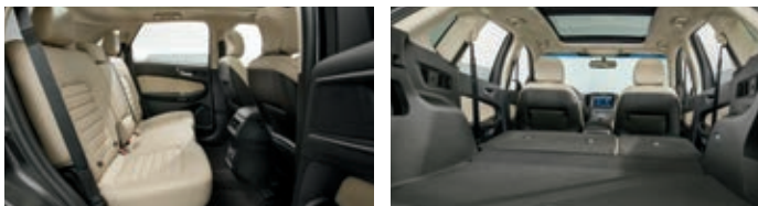
SEL. Guard. Available equipment.