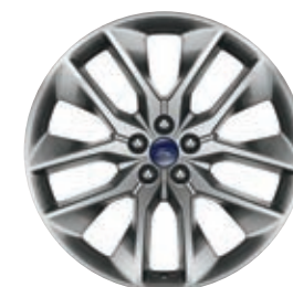
20" Polished Aluminum with Dark Stainless-Painted Pockets Available