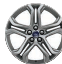
19" Luster Nickel-Painted Aluminum Standard