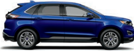
Deep Impact Blue