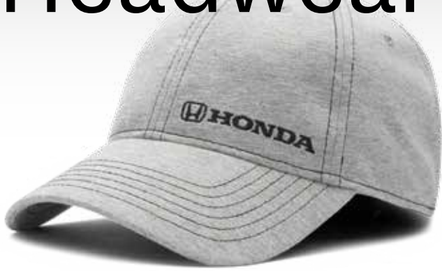
WEEKENDER JERSEY CAP 215181 100% cotton with structured crown and adjustable strap. MSRP $11.50