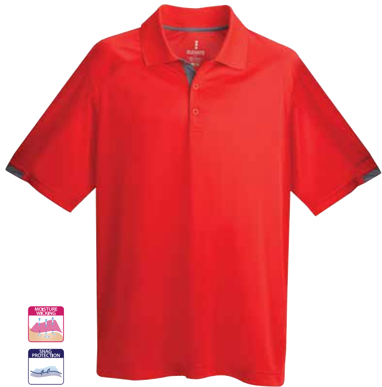
MEN'S FRENCHIE POLO 219213 100% micro-polyester with moisture-wicking finish and snag resistance. M-XL MSRP $29.00