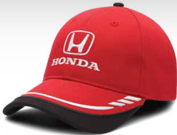
3-STRIPE PEAK CAP 215182

100% cotton twill with structured crown. Adjustable Velcro® backing and signature Honda tab on back.