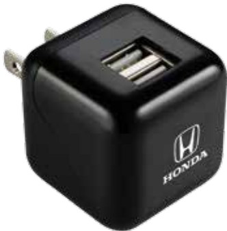
THE CUBE DUAL USB ADAPTOR 219246 ETL (extract, transform, load) Certified USB Dual Output AC Adaptor is compatible with most smartphones and tablets. Size: 1 1/2" h X 1 1/2" w X 1 1/2" l MSRP $13.00