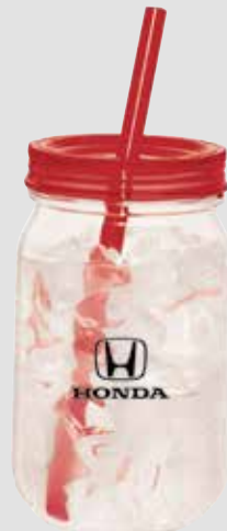
PLASTIC MASON JAR 25 OZ 196801 Stain and odour-resistant plastic jar includes plastic straw with stopper. BPA free. MSRP $6.00