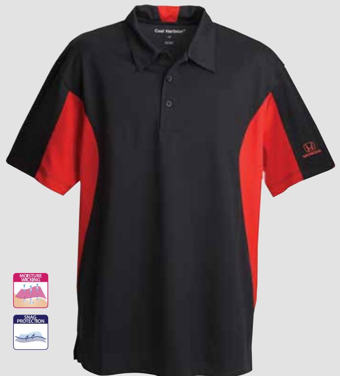
MEN'S COLOUR BLOCK POLO - BLACK 219205 100% polyester with moisture-wicking finish and snag resistance. M-XL MSRP $26.00