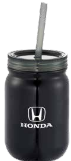
STAINLESS STEEL MASON JAR 24 OZ 219227 Trendy mason jar style features matching plastic screw-on lid and plastic straw. Large opening for easy cleaning. MSRP $11.00