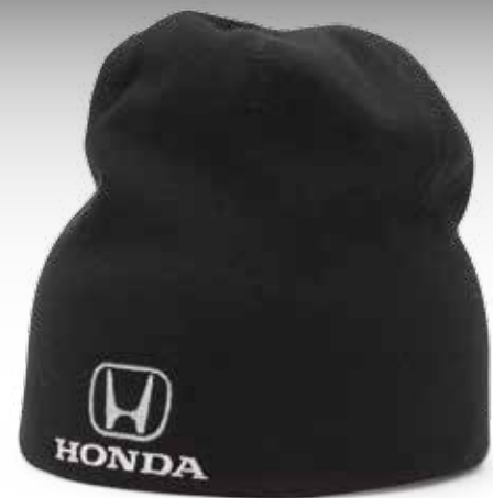
HONDA PERFORMANCE BEANIE 215184