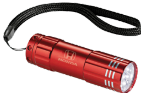
FLARE LED FLASHLIGHT 219273 Push-button on/off on base, includes wrist strap and 3 AAA batteries. MSRP $6.00