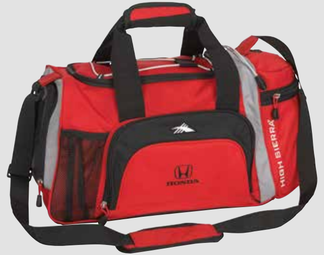
HIGH SIERRA® UTILITY DUFFEL 219253 Large main zippered compartment. Media pocket with headphone port. Mesh wet compartment rolls up when not in use. Size: 10 1/2" h x 10" w x 22" d MSRP $49.00