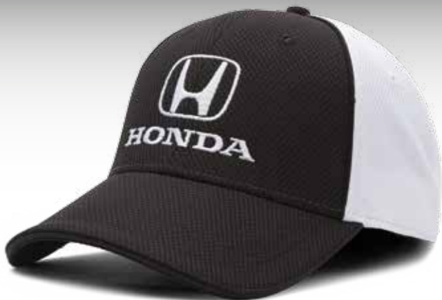
TEAM HONDA PERFORMANCE CAP - BLACK 219224

95% polyester/5% cotton diamond texture, structured front, adjustable Velcro® closure.