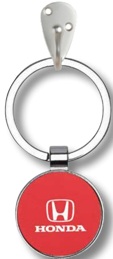
ROUND KEYCHAIN (2 PACK) 219260 Metal with matte metallic center plate, chrome trim and split ring. Size: 1 1/8" w MSRP $7.00