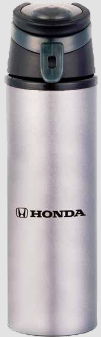
ALUMINUM SPORTS WATER BOTTLE 20 OZ 219228 Flip-top lid. Carabiner hook attached to lid. Large opening for easy cleaning and filling. MSRP $8.50