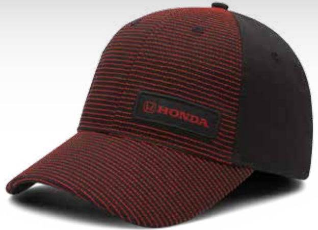
HONDA RED-STITCH CAP 215179 95% polyester/5% cotton diamond texture, structured front, adjustable Velcro® closure. MSRP $9.50