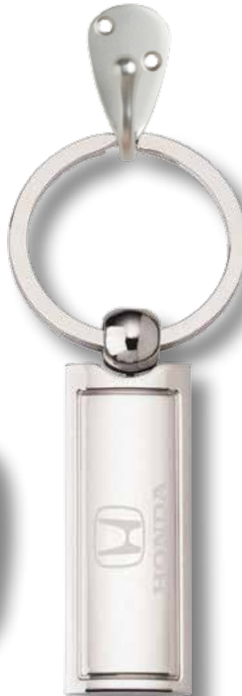
CHROME KEYCHAIN 155608 Metal key ring with center plate. Size: 1/2" w x 2" l MSRP $5.00