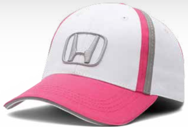
LADIES' BELLA CAP 196763

100% cotton twill with an adjustable Velcro® backing.