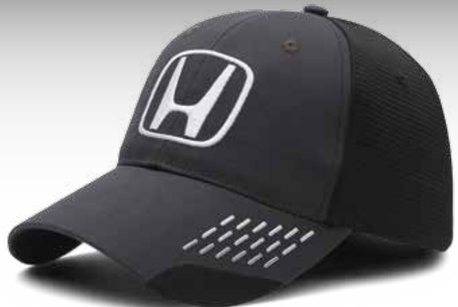
RACE PRO CAP 196793 100% cotton twill black cap with competition mesh. Hook and loop back closure. MSRP $11.50