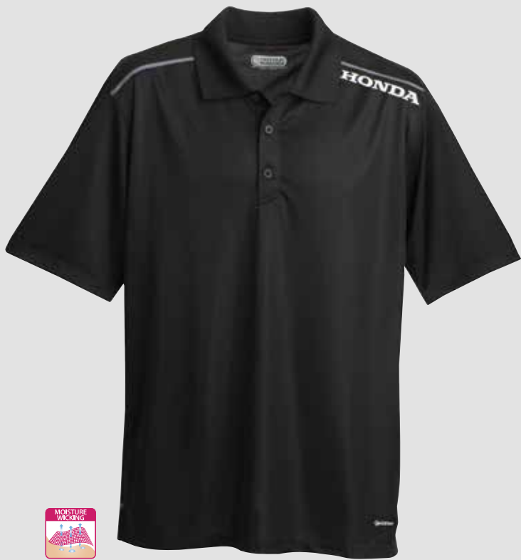
MEN'S PERFORMANCE POLO 196720 100% micro-polyester textured knit with moisture-wicking finish. Additional Honda logo on left side of shirt. M-XL MSRP $34.50