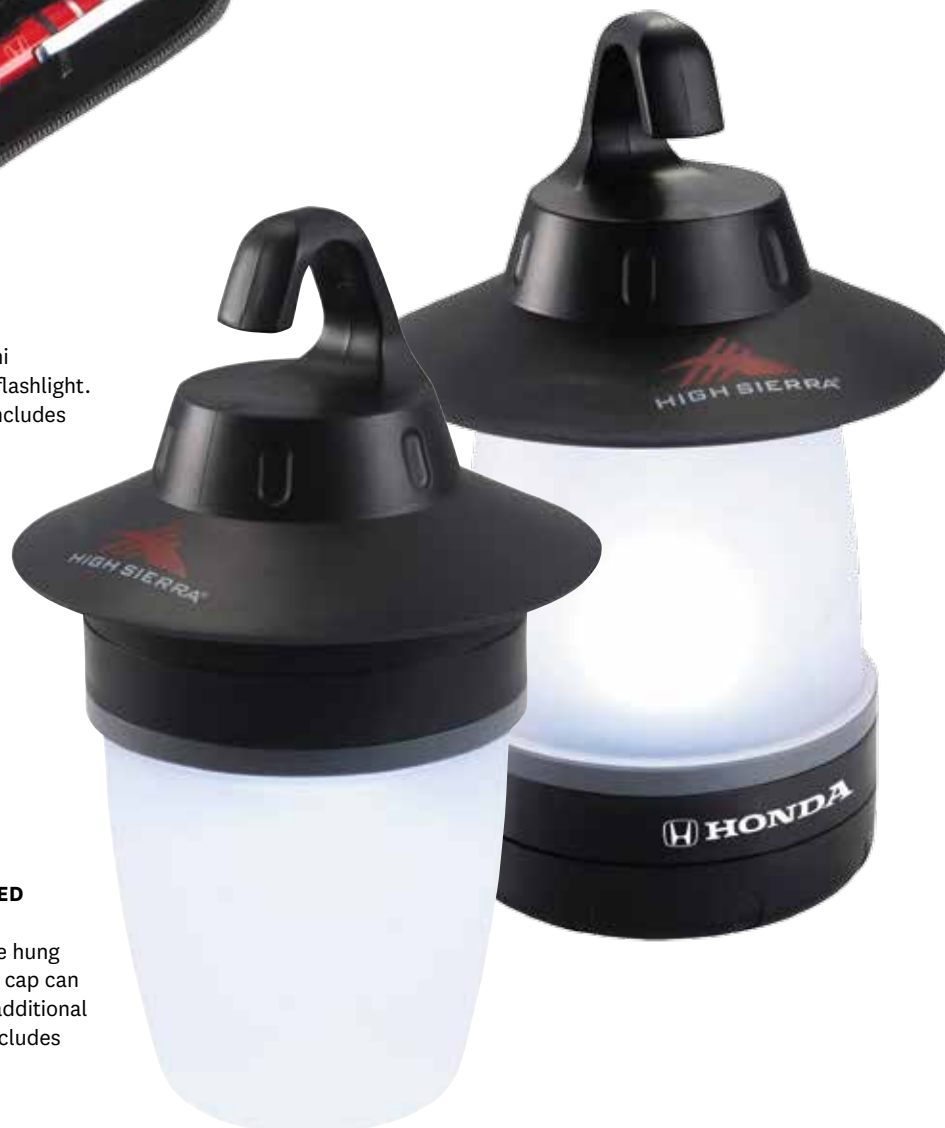
HIGH SIERRA® 2-WAY LED LANTERN 219293 2-way LED lantern can be hung from top hook or bottom cap can be removed to hang for additional overhead light supply. Includes 4 AA batteries. MSRP $11.50