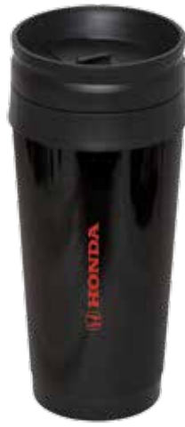
HONDA TRAVEL TUMBLER 16 OZ 175921 Double-walled, stainless steel exterior with plastic interior. Twist, slide open-close lid. BPA free. MSRP $7.00