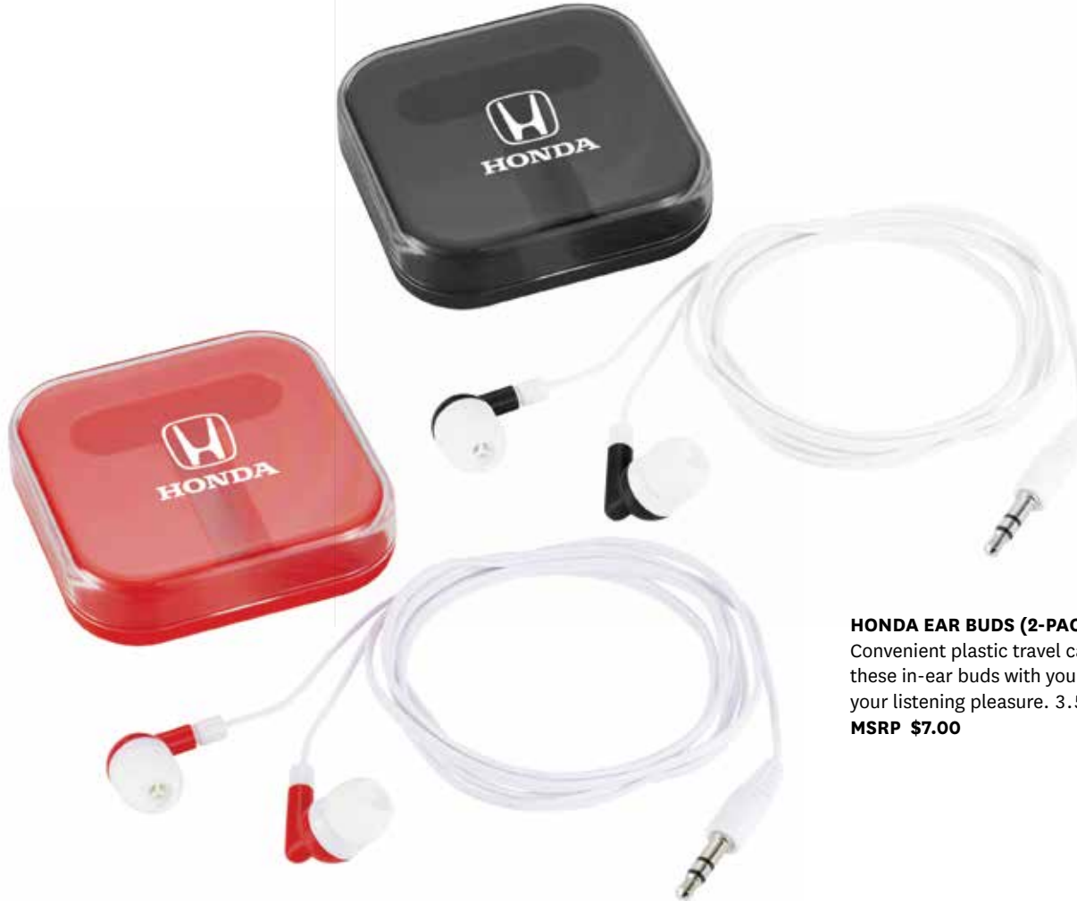
HONDA EAR BUDS (2-PACK) 219247 Convenient plastic travel case allows you to take these in-ear buds with you wherever you go for your listening pleasure. 3.5mm audio jack. MSRP $7.00