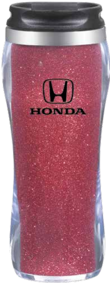
SPARKLE TUMBLER 16 OZ 219234 Double-walled construction with screw-on plastic flip-up spill resistant lid. BPA free. MSRP $14.00