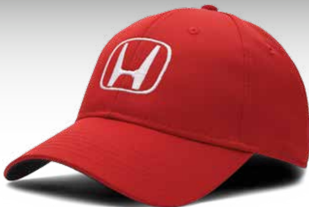
PERFORMANCE CAP 196796 95% polyester/5% cotton. Structured cap is moisture wicking and UV protected. Adjustable back strap with Velcro® closure. MSRP $13.00