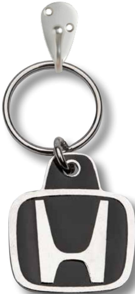
HONDA KEYCHAIN 196833 Custom nickel with shiny silver and black gloss finish. Size: 1 3/8" w x 1" l MSRP $5.00