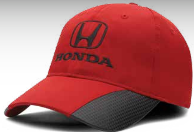
CARBON FIBER CAP 219221

100% polyester performance with carbon peak inserts, structured front, adjustable Velcro® closure.