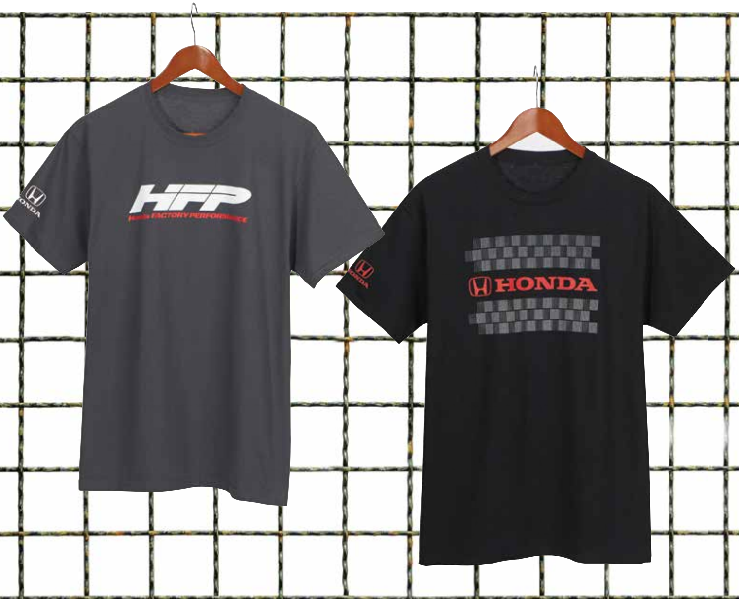
HFP TEE 219202 100% cotton. M-XL MSRP $10.50