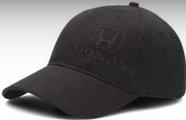
TONE-ON-TONE CAP 196770 50% cotton/50% polyester twill. Adjustable back strap. Mesh on side and back panels. MSRP $10.50