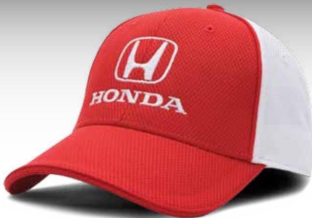
TEAM HONDA PERFORMANCE CAP - RED 219222

95% polyester/5% cotton diamond texture, structured front, adjustable Velcro® closure.