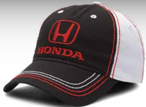
CONTRAST STITCH COTTON TWILL CAP 196771 100% cotton. Unstructured soft-lined front with matching adjustable back strap. MSRP $8.50