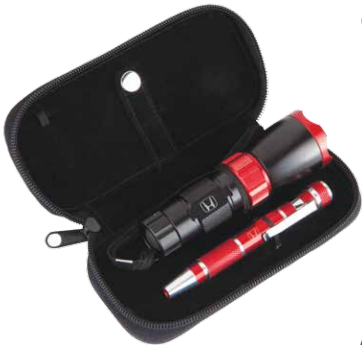
QUICK FIX COMBO 219274 Metal pen-style screwdriver with 8 mini screwdriver heads and LED aluminum flashlight. Zippered pouch included. Flash light includes 3 AAA batteries. MSRP $17.50