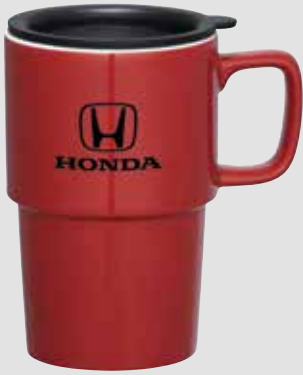
CERAMIC MUG WITH LID 17 OZ 177359 Ceramic travel mug with white lining and press-on plastic lid. MSRP $9.50