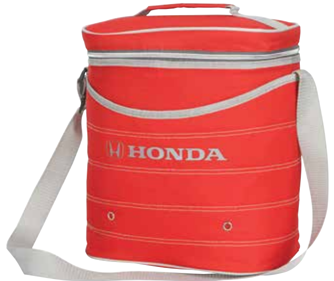
RACE-DAY COOLER 219244 100% polyester. Includes shoulder strap. Heat sealed and leak-resistant insulated interior. Includes front and back exterior pockets and internal elastic compartment. Size: 13" h x 11 3/4" w x 7 1/2" d MSRP $17.50