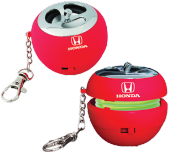
PORTABLE USB SPEAKER 167254 Glowing LED lit speaker. Fruit-shaped and compatible with iPhone®, iPod®, Blackberry®, mp3 players, laptops. Includes USB charging wire. 3.5mm audio jack. MSRP $13.00