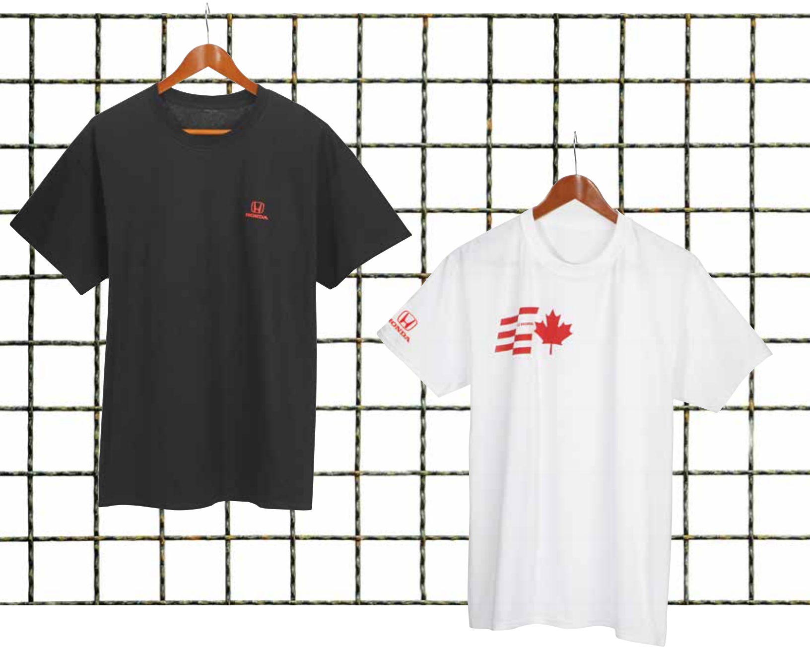
HONDA CLASSIC TEE 219196 100% cotton. M-XL MSRP $10.50