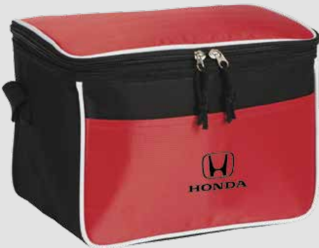
BREAKTIME SNACK BAG 219240 100% polyester. Large main compartment with front pocket. Adjustable shoulder strap and metallic lining. Size: 7" h X 11" w x 7 1/2" l MSRP $11.50