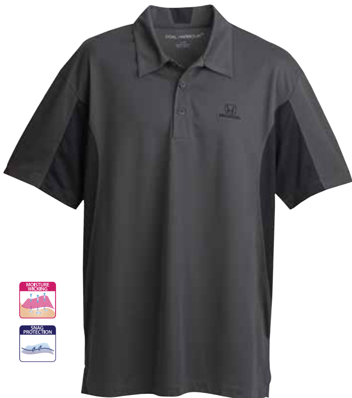
MEN'S COLOUR BLOCK POLO - GREY 219212 100% polyester with moisture-wicking finish and snag resistance. M-XL MSRP $26.00