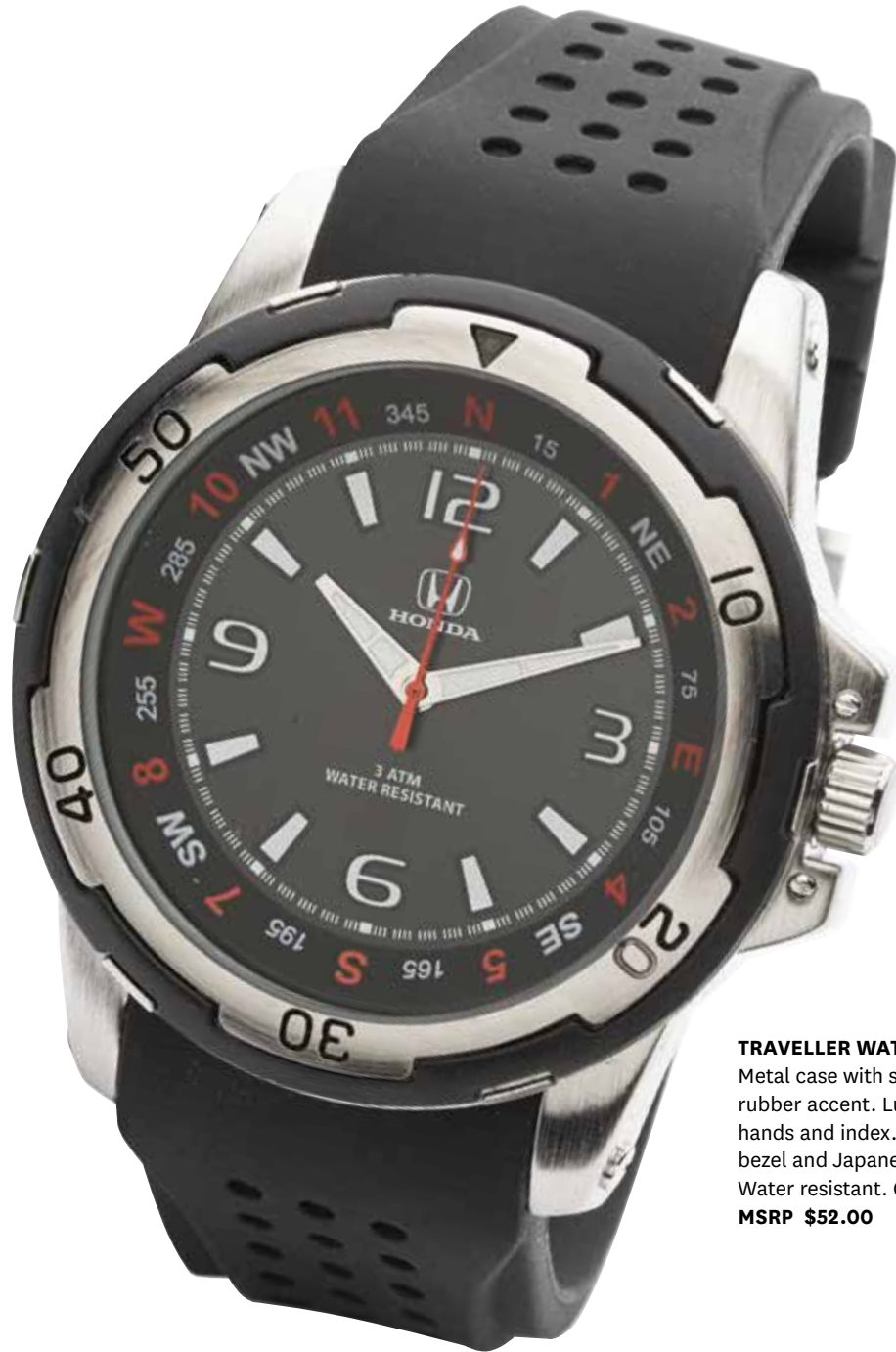
TRAVELLER WATCH 196842 Metal case with satin silver finish and rubber accent. Luminous sweeping hands and index. Features rotating bezel and Japanese quartz movement. Water resistant. Gift box included. MSRP $52.00