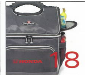
Pit Crew Collection