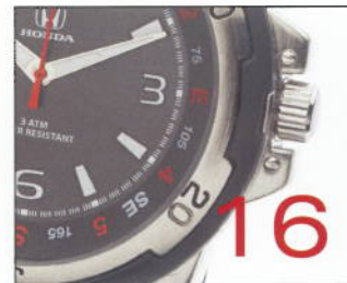
Sport and Leisure