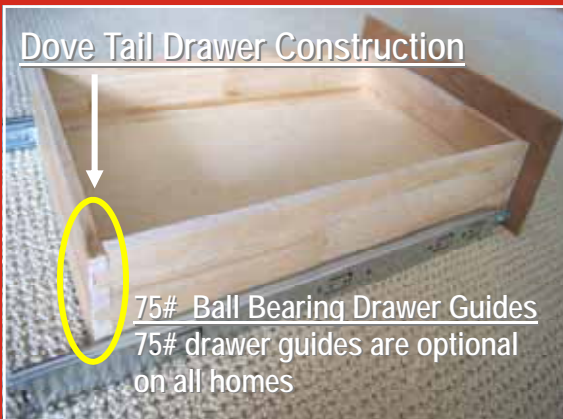
Dove Tail Drawers