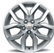
19" Machined-Face Aluminum (Standard on LTZ)