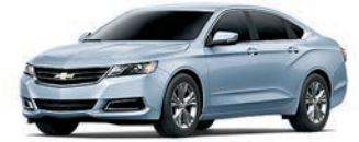
SILVER TOPAZ METALLIC 1,3