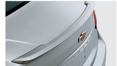
Spoiler (all body colors)

1 Interim availability. 2 Not available with Jet Black/Mojave interior. 3 Not available on Eco. 4 Extra-cost color. 5 Not available on LS. 6 Not available with Jet Black/Brownstone interior. 7 Not available on LTZ. 8 Requires available Premium Seating Package, Premium Audio and Sport Wheels Package, Advanced Safety Package, Convenience Package and sueded microfiber interior. 9 Requires available V6 engine, Premium Audio Package, Comfort and Convenience Package, and Chevrolet MyLink Radio with Navigation.