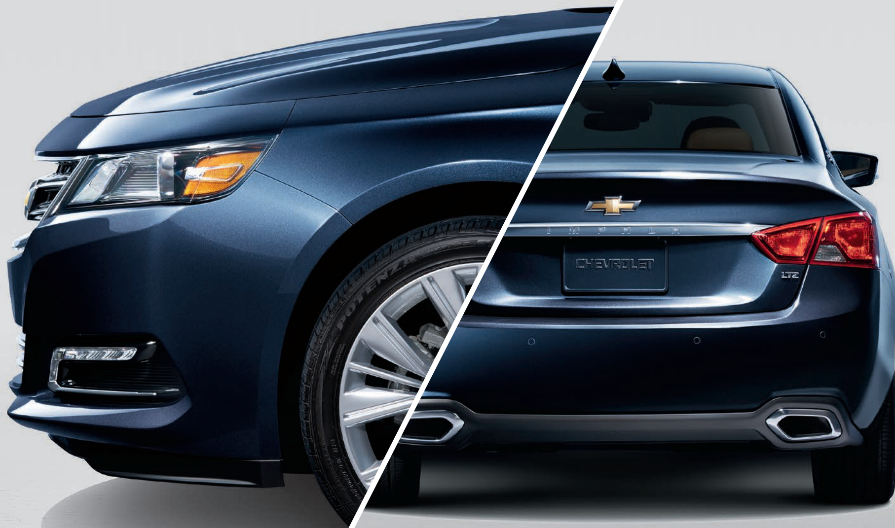
Impala LTZ in Blue Ray Metallic with available features.