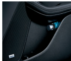
Convenient umbrella storage.