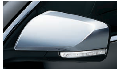
Chrome Mirror Caps