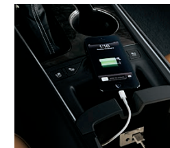
Available USB port 2