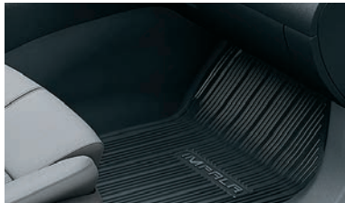
All-Weather Floor Mats

PERSONALIZE YOUR IMPALA AT CHEVROLET.COM/ACCESSORIES