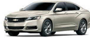
CHAMPAGNE SILVER METALLIC 2