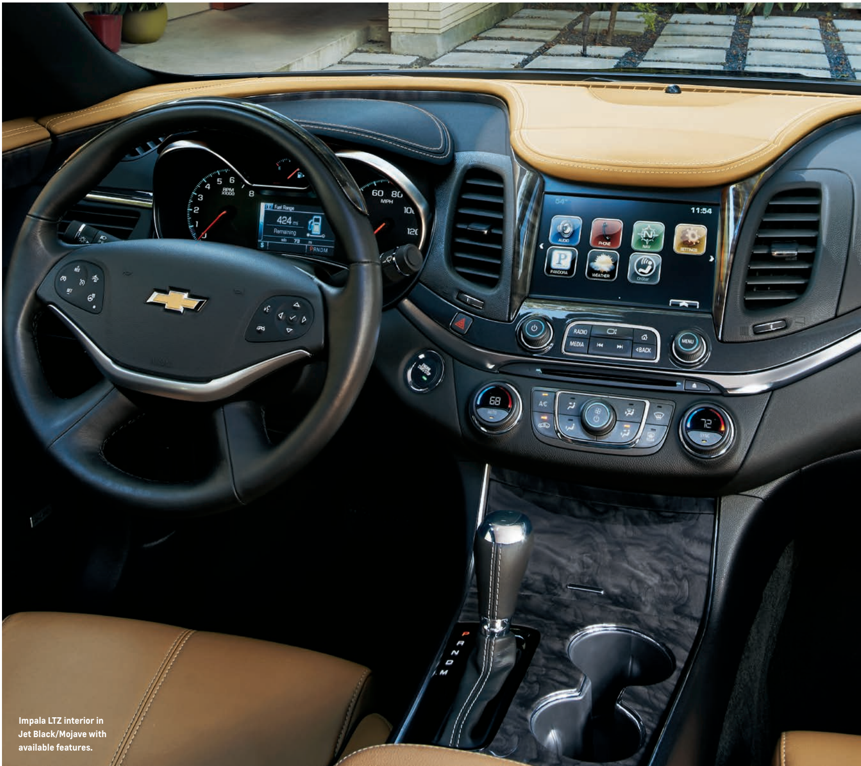
Impala LTZ interior in Jet Black/Mojave with available features.