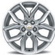
19" Painted-Aluminum (Available on LT) 9