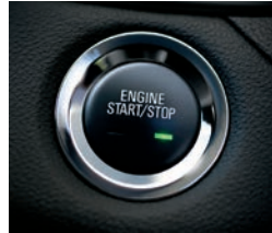
Available Keyless Access with Push-Button Start.