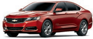
RED ROCK METALLIC 1,2