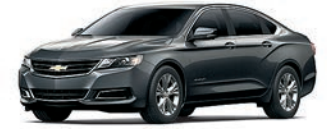
ASHEN GRAY METALLIC 6