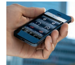
Available OnStar RemoteLink ® mobile app 5

CHOOSE YOUR GRAPHICS This award-winning Chevrolet MyLink 1 system features four specific graphic appearances for the touch-screen and the Driver Information Center (Contemporary, Edge, Velocity and Main Street), selectable through the Settings menu.