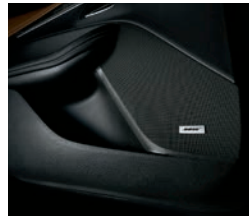
Available 11-speaker Bose® Centerpoint® Surround Sound System.