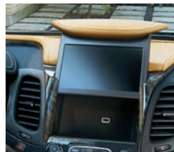
Hidden, lockable storage space behind the available color touch-screen radio.