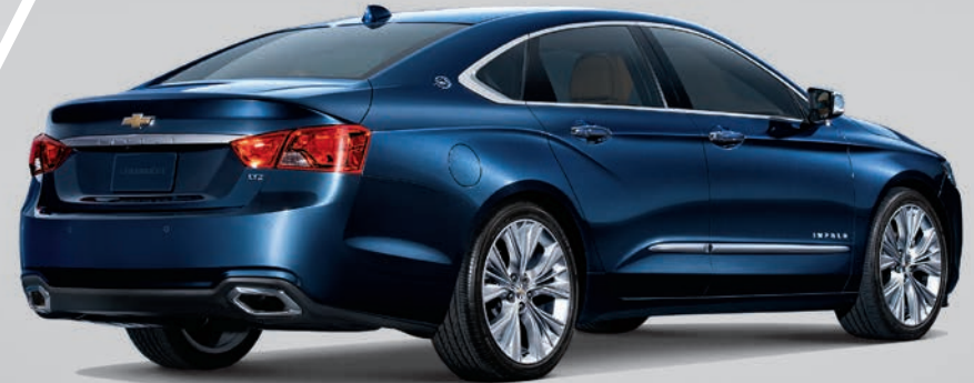
Impala LTZ in Blue Ray Metallic with available features.