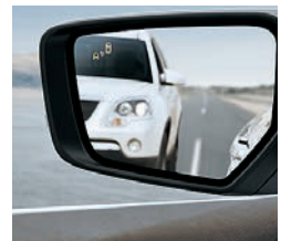
Available Side Blind Zone Alert. 3