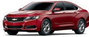
CRYSTAL RED TINTCOAT 2,4,5