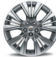
20" Aluminum (Available on LTZ) 9