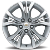
18" Painted-Aluminum (Standard on LT and Eco)