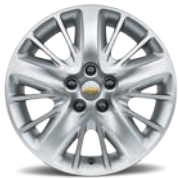
18" Steel with Fascia-Spoke Wheel Cover (Standard on LS)