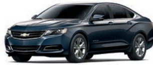
BLUE RAY METALLIC