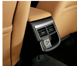
Available 120-volt household-style power outlet.