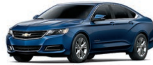
BLUE TOPAZ METALLIC 1,2,3