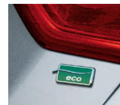
Impala Eco badge.

SMOOTH OPERATOR In addition to the overall shape that promotes seamless airflow, Impala Eco features active Aero Grille Shutters that close electronically so air can flow around the car, decreasing wind resistance. The shutters open intuitively, when the engine needs air for cooling, using only electricity. To further increase efficiency, Impala Eco sports low rolling resistance tires that reduce friction.