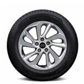
Available 17" alloy wheels