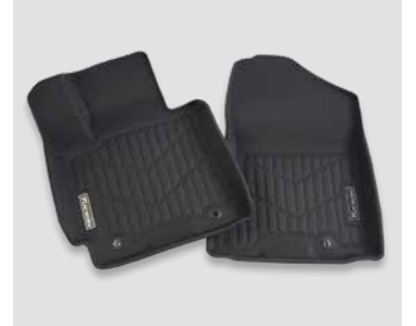
Premium all-weather floor liners

Designed to meet your towing needs, a Hyundai hitch can accommodate a wide variety of hitch-mounted accessories. Kit includes the trailer hitch, ball mount and end cap. Chrome ball shown not included.