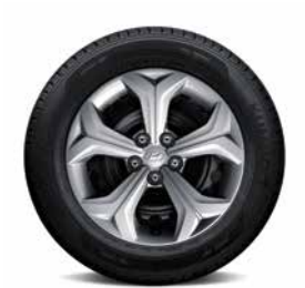
Standard 17" steel wheels