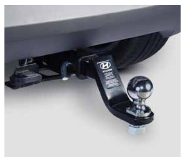
Trailer hitch kit

Getting in and out of your vehicle is easier with a set of durable running boards.