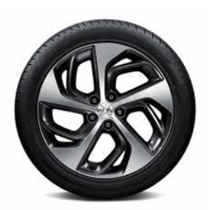
Available 19" alloy wheels with black accents

Choice of interior colour depends upon model and/or exterior colour selection. Colours shown are for reference only and may vary from the actual hue and appearance. Visit hyundaicanada.com, or see your dealer for details.