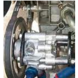
New power steering pump installed