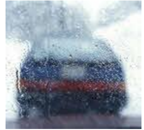
Impaired view from worn wiper blades

Most wiper blade manufacturers recommend replacing your wiper blades or wiper blade inserts every 6 months or 6,000 miles. Something as simple and as inexpensive as replacing your windshield wiper blades will make your driving experience for you and your family a safer one.