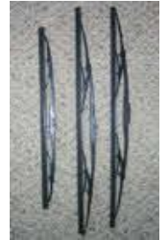
New wiper blades