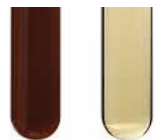
Brake fluid before and after service