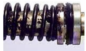
Harmful deposits on brake master cylinder piston assembly

Worn-out, oxidized brake fluid causes corrosion and harmful deposits and varnish build up. A brake flush service should be performed when your brake fluid shows contamination or every 30,000 to 40,000 miles.