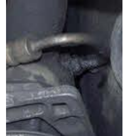
Power steering leak at pump

The vehicle's power steering system is a very important component that is frequently overlooked during service and maintenance. Repairing leaks in this system will extend its life, improve the power steering function, and greatly reduce the chance of a power steering system failure.