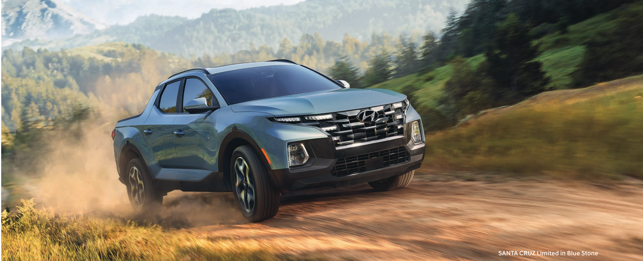
SANTA CRUZ Limited in Blue Stone