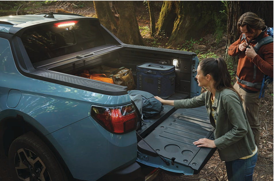
Sheet molded composite bed with rail system, adjustable tie-down cleats and LED bed lighting