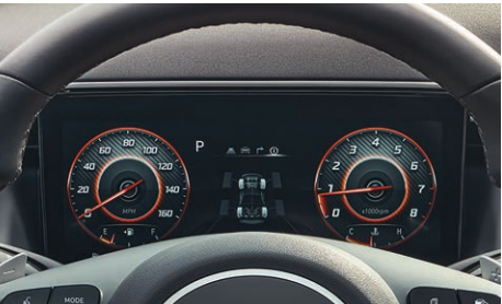
10.25" digital LCD instrument cluster