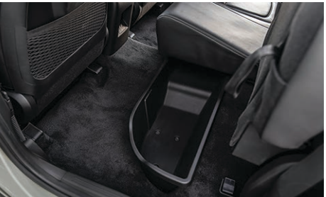
Rear under-seat storage tray