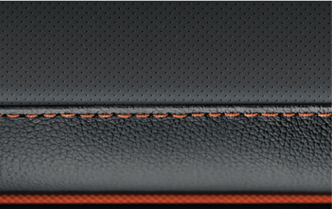
Dark Gray Leather / Orange Accents Limited