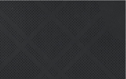
Black Leather Limited