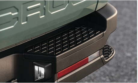
Integrated multi-level rear bumper steps