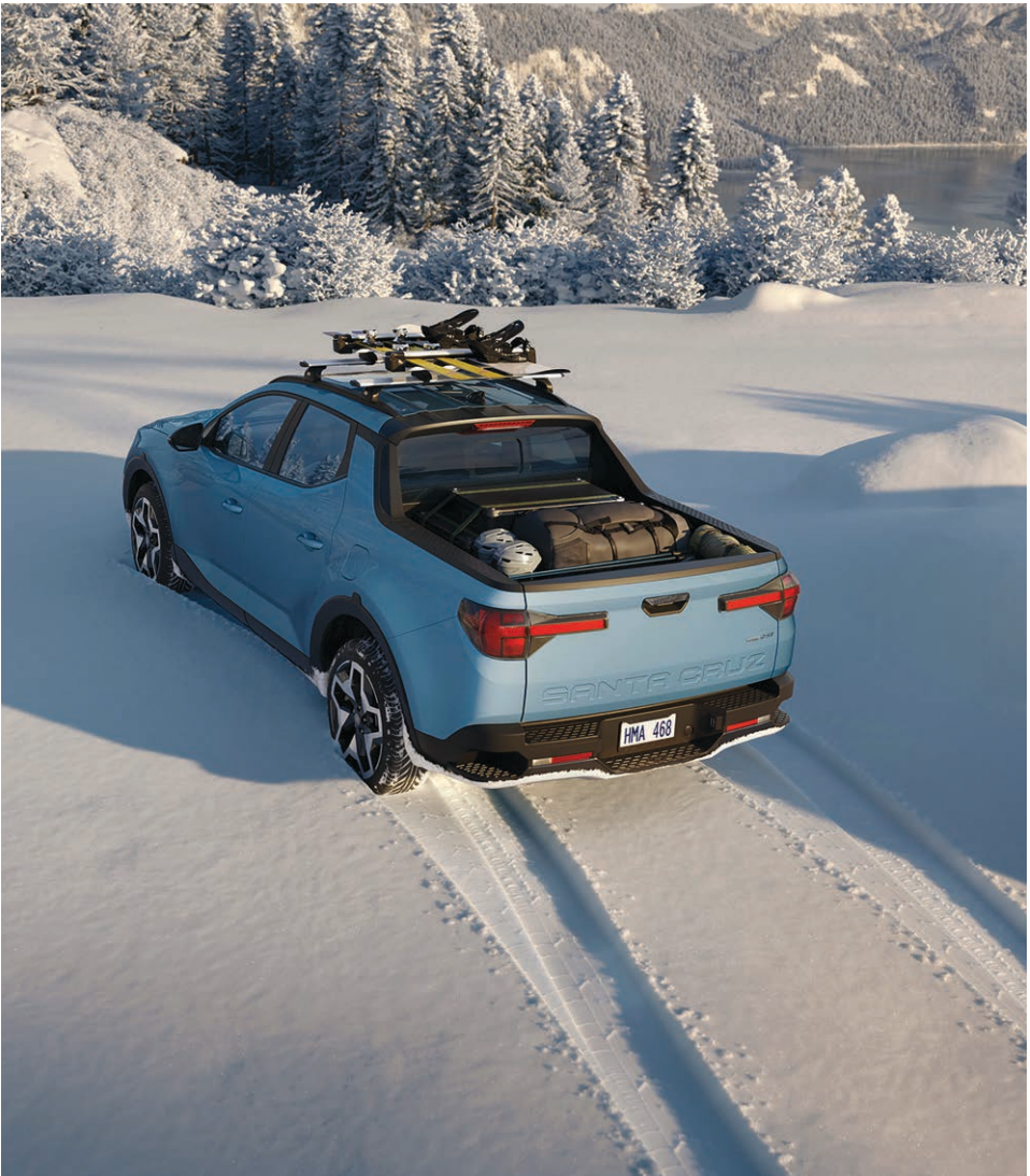
HTRAC All Wheel Drive

A must-have for long trips, Santa Cruz Limited's Highway Driving Assist helps keep you in your lane at a safe distance from the traffic ahead while automatically adjusting your cruise control for changing speed limits. 7