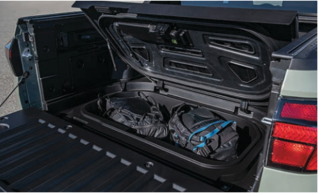
Lockable under-bed storage compartment