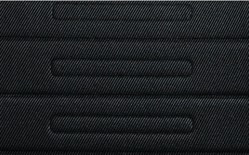
Black Cloth SE / SEL / SEL Premium