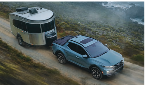
Trailer pre-wiring and 5,000-lb towing capacity