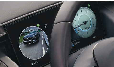
Blind-Spot View Monitor