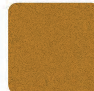
Caramel Bronze Pearl