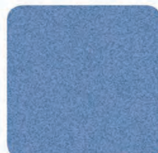
Sky Blue Metallic