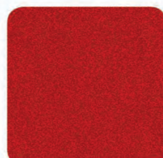
Ruby Red Pearl