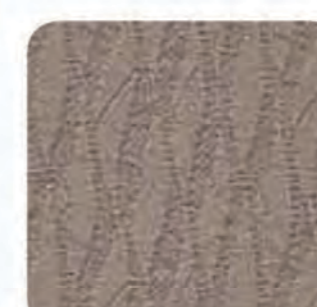
Warm Ivory Cloth (WIC)