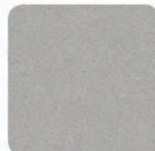
Ice Silver Metallic