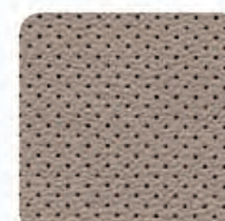
Warm Ivory Leather (WIL)