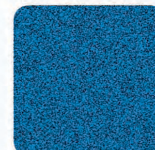
Deep Indigo Pearl