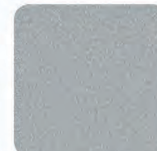
Graphite Gray Metallic