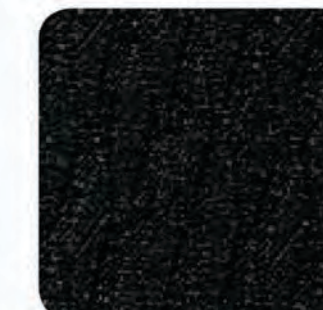
Off-Black Cloth (OBC)