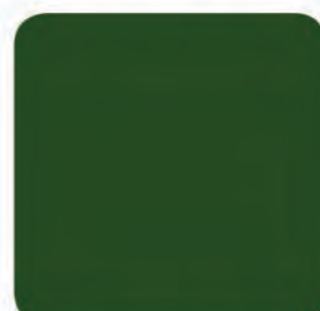
Cypress Green Pearl