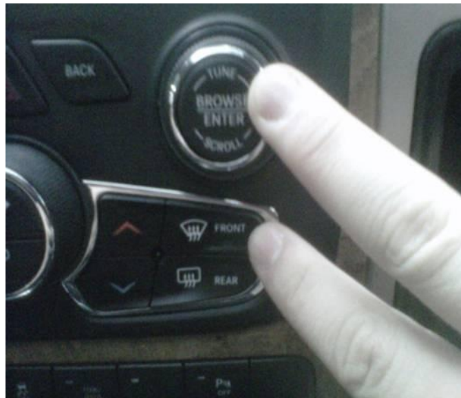
Fig. 2 Take Vehicle Out of Ship Mode