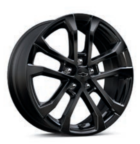
17" Black-Painted Aluminum Wheels Standard on Premier Hatchback; available on Premier Sedan<sup>1</sup>