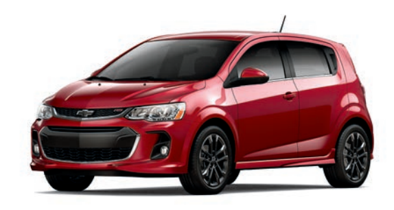
Cajun Red Tintcoat<sup>1, 2</sup>