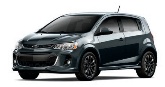
Nightfall Gray Metallic