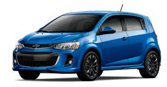
Kinetic Blue Metallic<sup>1</sup>