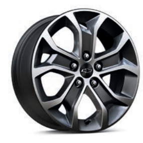
16" Aluminum Wheels Standard on LT Hatchback; available on LT Sedan1