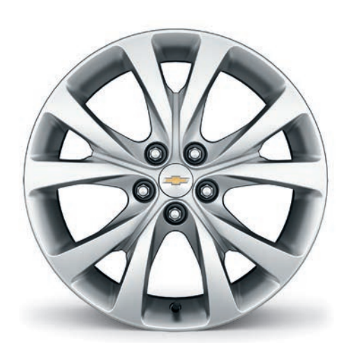
17" Silver-Painted Aluminum Wheels available from Chevrolet Accessories.