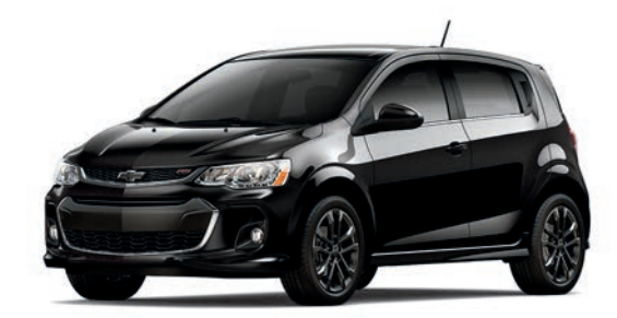
Mosaic Black Metallic