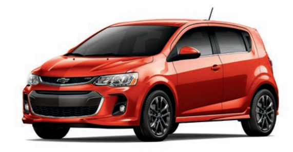
Cayenne Orange Metallic<sup>1,3</sup>