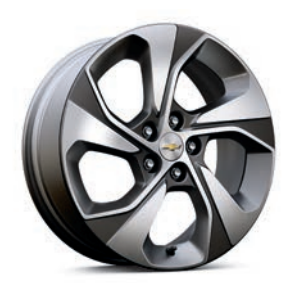
17" Painted-Aluminum Wheels Standard on Premier Sedan