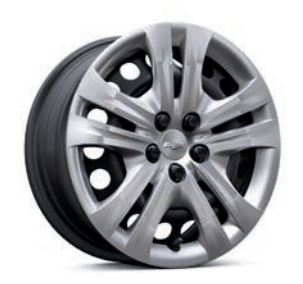
15" Steel Wheels with Painted Wheel Covers Standard on LS Sedan