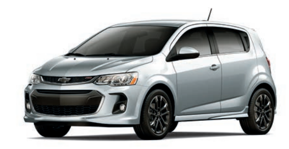
Silver Ice Metallic