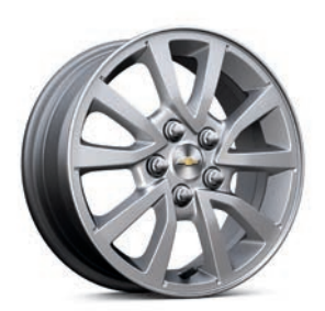
15" Aluminum Wheels Standard on LT Sedan