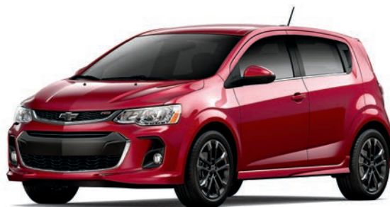
CAJUN RED TINTCOAT 1,2