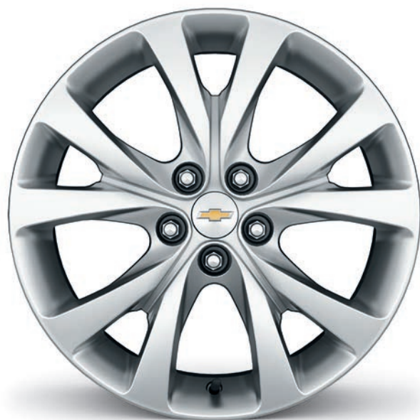
17" Silver-Painted Aluminum Wheel available from Chevrolet Accessories.