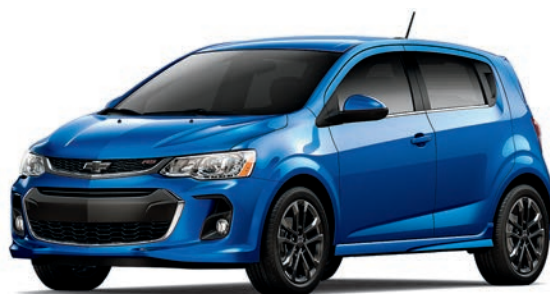
KINETIC BLUE METALLIC 1