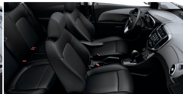
Jet Black Perforated Leatherette with Dark Titanium Accents 5

1 Standard on Premier Hatchback. Standard on Premier Sedan with manual transmission. Available on Premier Sedan with automatic transmission and RS Package. 2 Standard on LS Sedan. 3 Standard on LT Sedan. 4 Standard on LT Hatchback. Available on LT Sedan; requires available RS Package. 5 Available on Premier Sedan; requires available automatic transmission.