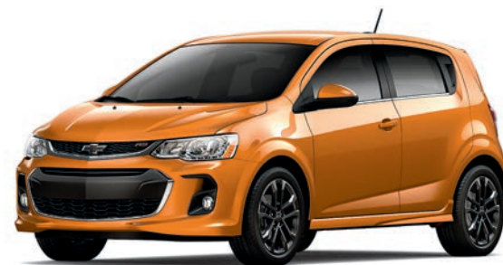
ORANGE BURST METALLIC 1,3