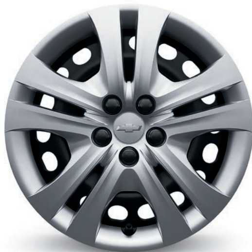
15" Steel with Bolt-On Wheel Cover (Standard on LS)