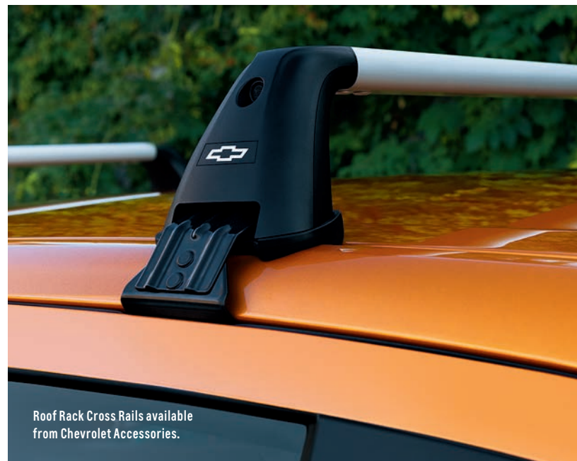
Roof Rack Cross Rails available from Chevrolet Accessories.