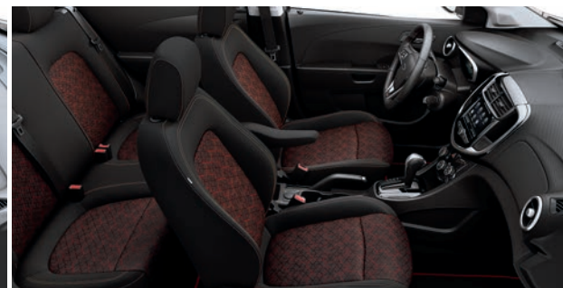
Jet Black Deluxe Cloth with Jet Black Accents 4