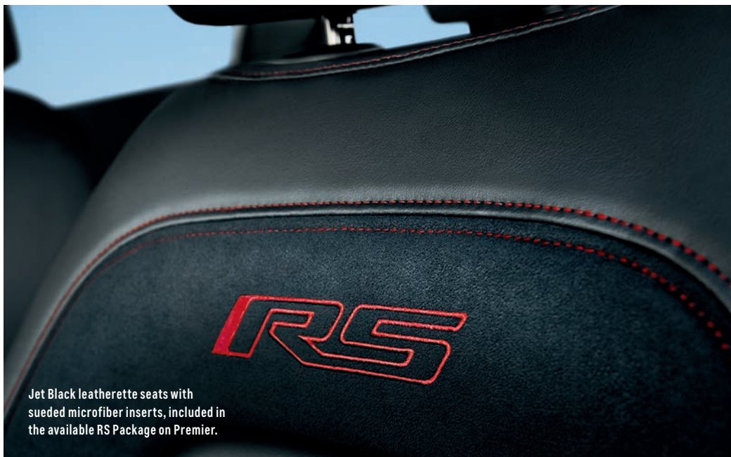
Jet Black leatherette seats with sueded microfiber inserts, included in the available RS Package on Premier.