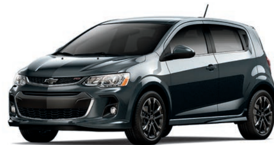
NIGHTFALL GRAY METALLIC