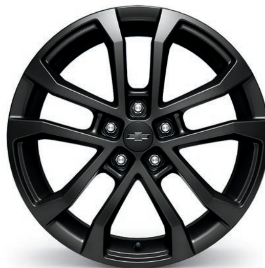
17" Black-Painted Aluminum (Standard on Premier RS Hatchback. Available on Premier Sedan; requires available RS Package)