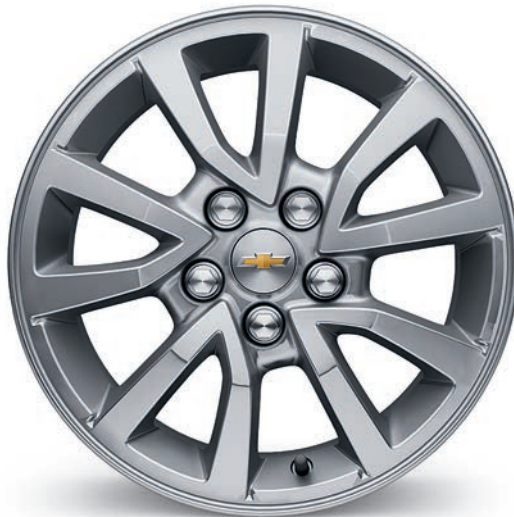
15" Aluminum (Standard on LT Sedan)