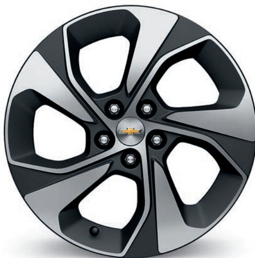
17" Painted-Aluminum (Available on Premier Sedan with automatic transmission)