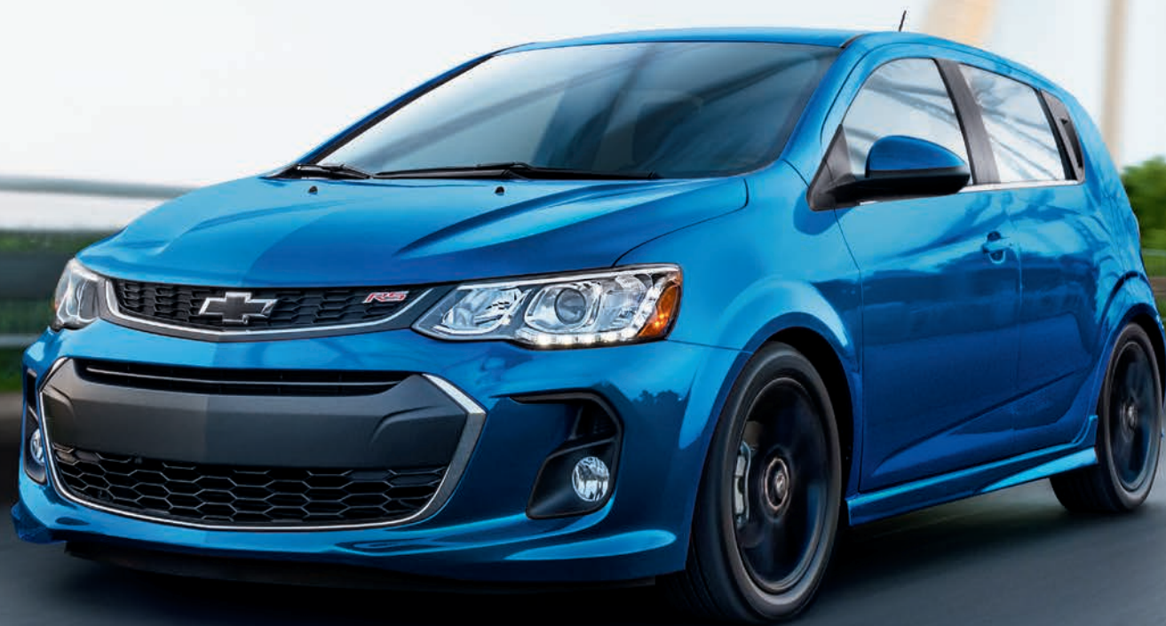
Sonic Premier RS Hatchback in Kinetic Blue Metallic (extra-cost color).

POWER COMES STANDARD. The ECOTEC® 1.4L turbocharged engine offers up to an EPA-estimated 38 MPG highway 1 and delivers 138 horsepower and 148 lb.-ft. of torque. Sounds like fun, doesn't it?