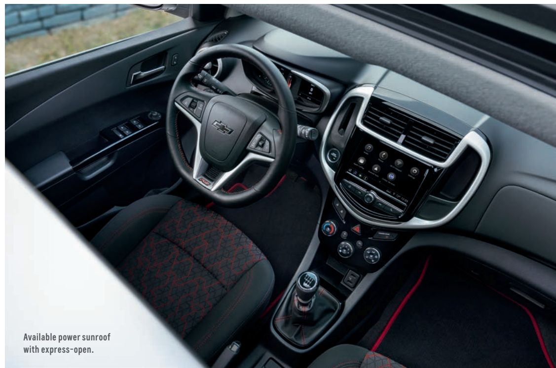
Available power sunroof with express-open.