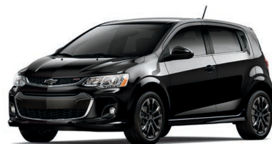
MOSAIC BLACK METALLIC

1 Extra-cost color. 2 Not available on LS Sedan. 3 Available on Hatchback only.