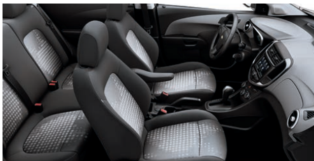
Jet Black Sport Cloth with Dark Titanium Accents 2