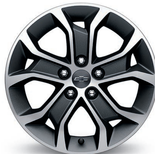
16" Aluminum (Standard on LT Hatchback. Available on LT Sedan; requires available RS Package)