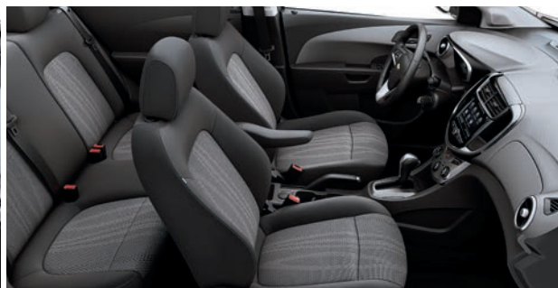
Dark Pewter Deluxe Cloth with Dark Titanium Accents 3