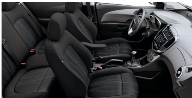
Jet Black Deluxe Cloth with Dark Titanium Accents 3