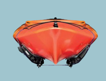
KAYAK CARRIER<sup>(1)(2)</sup> [TCKAY883]