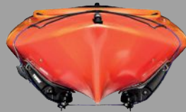
KAYAK CARRIER (1)(2) [ TCKAY883 ]