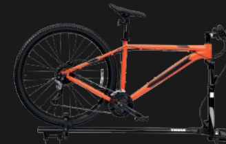
FORK-MOUNT BIKE CARRIER (1)(2) [ TCFKM526AB ]