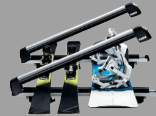
SKI AND SNOWBOARD CARRIER (1)(2) [ TCS92725 ]