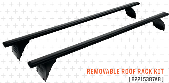
REMOVABLE ROOF RACK KIT [ 82215387AB ]

YOUR JEEP® GLADIATOR + THE REMOVABLE ROOF RACK KIT OR TRAIL RAIL™ SYSTEM CROSS RAILS + THE CARRIER OF YOUR CHOICE = ENDLESS OPPORTUNITIES FOR ADVENTURE. WHETHER YOU'RE HEADED TO CATCH SOME WAVES OR CATCH UP WITH FAMILY, MOPAR® RACKS AND CARRIERS HELP YOU BRING WHAT YOU WANT WHEREVER YOU'RE GOING. SIMPLY ADD THE REMOVABLE ROOF RACK KIT OR BED CROSS RAILS AND CHOOSE THE CARRIER THAT MATCHES YOUR ACTIVITY. SPORT, BIKE AND CARGO CARRIER OPTIONS FROM MOPAR LET YOU BRING – AND HAVE – IT ALL.