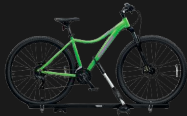
UPRIGHT BIKE CARRIER (1)(2) [ TCOE5599 ]