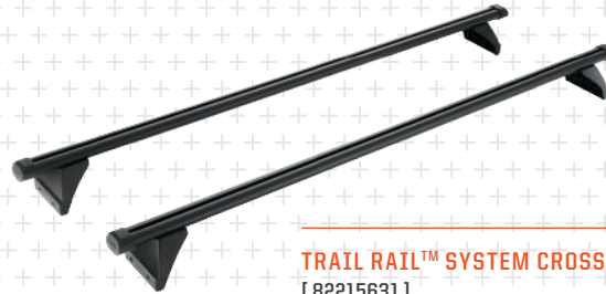
TRAIL RAIL™ SYSTEM CROSS RAILS (1) [ 82215631 ]