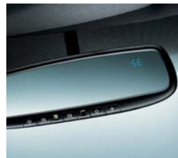
AUTO-DIMMING REAR-VIEW MIRROR WITH HOMELINK®22 AND COMPASS