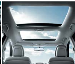
PANORAMIC SUNROOF (SX) (available w/Black Dove high-style interior seating color)