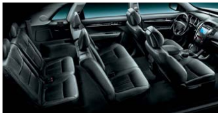
50/50 SPLIT-FOLDING THIRD-ROW SEATS (LX) Requires Convenience Package.