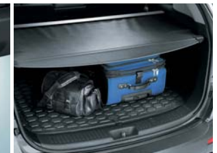
CARGO COVER/CARGO MAT