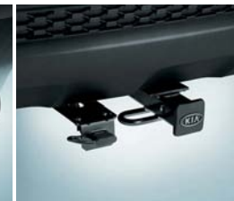
TOW HITCH 15