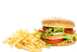
FAST FOOD SPILLS