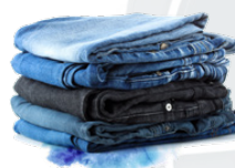
BLUE JEAN DYE TRANSFER