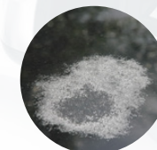
FADING & OXIDATION