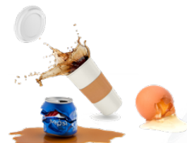
FOOD & BEVERAGE SPILLS