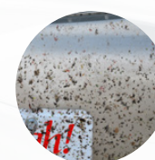
INSECTS & LOVE BUGS