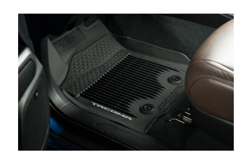
Tub Style All Season Floor Mats $166.50

High-performance LED truck bed lighting helps improve cargo management at night or in dark locations •Two separate light assemblies—on the inside bed walls and near the rear of the cargo area provide excellent light distribution while loading and unloading •Precise placement angles lights toward important cargo locations •Constructed of highquality, durable materials