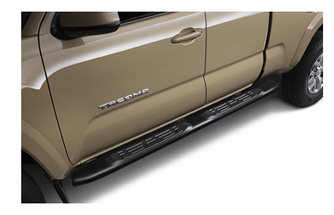
5-in. Oval Tube Steps - Black $815.50

Guard your Tacoma from weathering, UV radiation and road debris that can chip and scratch the finish with 3M Pro Series Genuine Toyota Paint Protection Film. This durable and nearly invisible thermoplastic urethane is designed to protect the hood and front fenders to maintain a like-new appearance. Backed by a 10 year limited warranty. At participating dealers only