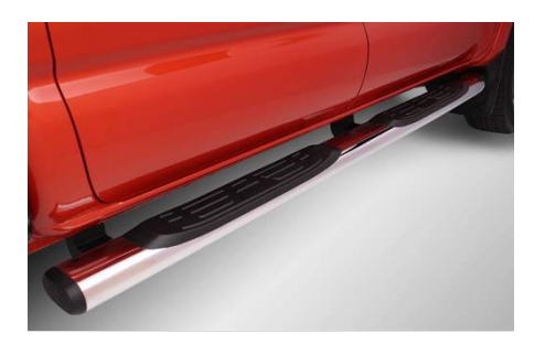
Side Step Bars - 5-inch Chrome $900.50

It's simple physics. Increasing air flow helps increase performance! When you add a TRD Performance Air Intake System to your truck you get all the benefits of free-flowing colder air. These systems have been dyno tested to deliver enhanced horsepower and torque for superior acceleration, plus more pulling power.