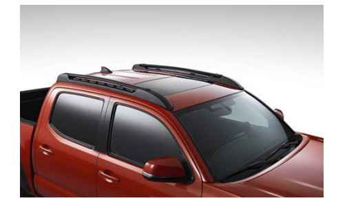
Roof Rack $522.50

Designed for Tacoma Double Cab models, the Roof Rack further enhances the truck's utility and cargo management versatility. The low-profile design integrates with Tacoma's styling, and the cross bars can be locked in place or stowed in line with the roof rails when not in use. Rated for a 100 lbs load capacity when evenly distributed across both bars.