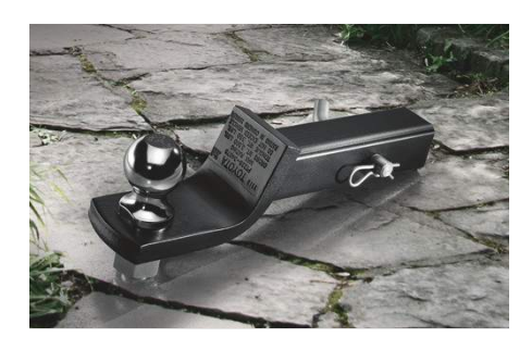
Towing Hitch Ball - 2 5/16" - 14,000 lbs $58.50

Enhance your connection to your Tacoma every time you shift with the TRD Shift Knob. Delivers an enhanced shifting feel while providing an impressive addition to your interior.