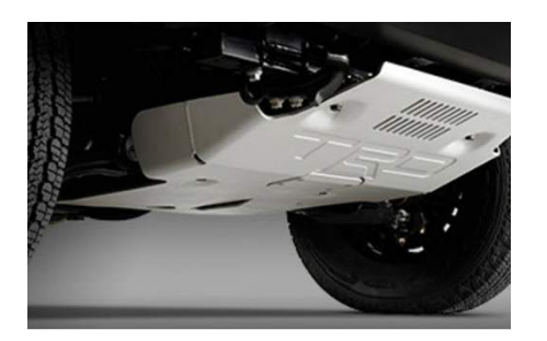
TRD Front Skid Plate $616.00

Help keep the underbelly of your Tacoma safe from vengeful boulders with the TRD front skid plate. -Enhances Tacoma's tough, capable stance -Helps protect vehicle underbody from damage that can result from flying stones, branches, ice chunks and other types of road debris -Made from stamped and formed 1/4-in.thick silver powder-coated aluminum -Skid plate won't interfere with or block the cooling system, while providing cut outs for unobstructed access to all maintenance points and vehicle tow hooks -Rigorous CAD simulations conducted by Toyota engineers, in addition to real world testing, help to maximize protection and prevent vibration stress and noise issues -Easy, no-drill installation uses vehicle's existing attachment mounts