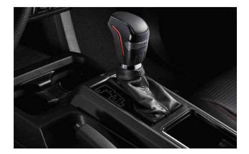
TRD Shift Knob $176.50

The Toyota Towing Hitch Ball is designed and tested to meet your Toyota's towing specification and quality standards.