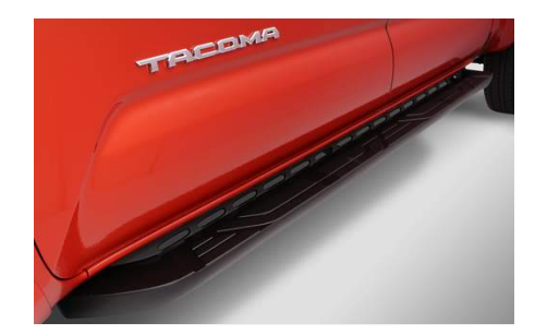
Running Boards $529.98

Secure your spare tire with a precision machined lock constructed of hardened steel with zinc-nickel plating. It quickly attaches to the spare's crank-down tool receiver mechanism, and the key attaches to the crank-down tool in the vehicle's tool kit.