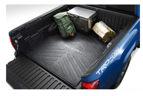
Bed Mat $131.50

Gain easy access into your Tacoma while enhancing the exterior appearance. These durable and robust 5-inch Side Step Bars feature dual-moulded, skidresistant step pads and come in a brilliant chrome finish. Not only does the chrome finish look great, it also provides protection against the elements.