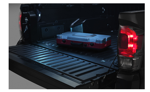
Bed Lighting Kit $403.05

The new 16" TRD glossy black alloy wheel do more than compliment the tough exterior of the new 2018 Tacoma. The alloy wheel incorporates the proper weight, offset and brake clearance to ensure fit, finish, and reliability. The bold new attitude and chiseled character lines of the 2017 Tacoma TRD match perfectly with the 16" TRD Alloy Wheels.