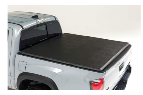
Soft Tri-Fold Tonneau Cover $782.50

Help keep the underbelly of your Tacoma safe from vengeful boulders with the TRD front skid plate. -Enhances Tacoma's tough, capable stance -Helps protect vehicle underbody from damage that can result from flying stones, branches, ice chunks and other types of road debris -Made from stamped and formed 1/4-in.thick silver powder-coated aluminum -Skid plate won't interfere with or block the cooling system, while providing cut outs for unobstructed access to all maintenance points and vehicle tow hooks -Rigorous CAD simulations conducted by Toyota engineers, in addition to real world testing, help to maximize protection and prevent vibration stress and noise issues -Easy, no-drill installation uses vehicle's existing attachment mounts