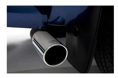
Exhaust Tip $105.50

Designed to offer an extra measure of cargo carrying capacity, these truck bed D-rings help provide a secure method of tying down equipment and gear in the Tacoma bed. Sturdy construction and pivoting capability allow for multiple positions and use. (Max capacity per ring is 199.6 kgs).