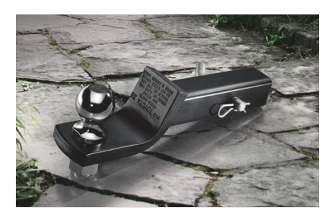
Towing Hitch Ball - 2" - 6,000 lbs $33.50

Add to your Tacoma's bold style with these shiny exhaust tips. Built Toyotatough, they're constructed from polished, corrosion resistant double-walled 304 stainless steel. Plus, they're easy to install – no cutting, drilling or welding! Features a finely etched Toyota logo.