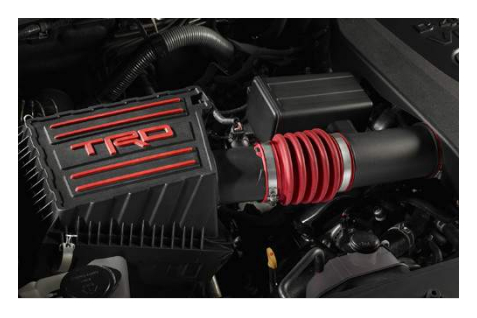
TRD Performance Air Intake System $758.00

Designed for Tacoma Double Cab models, the Roof Rack further enhances the truck's utility and cargo management versatility. The low-profile design integrates with Tacoma's styling, and the cross bars can be locked in place or stowed in line with the roof rails when not in use. Rated for a 100 lbs load capacity when evenly distributed across both bars.