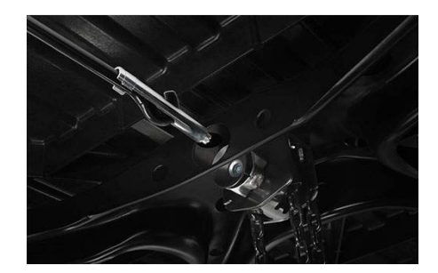
Spare Tire Lock $99.50

Versatile tri-fold design to suit all kinds of cargo needs. - The hard tri-fold tonneau cover adds extra security with five rotary latches, so you can rest assured that your cargo is protected. - This hard trifold tonneau cover is weather-resistant and can fold to the cab for bed access -Meets Toyota's high quality standard