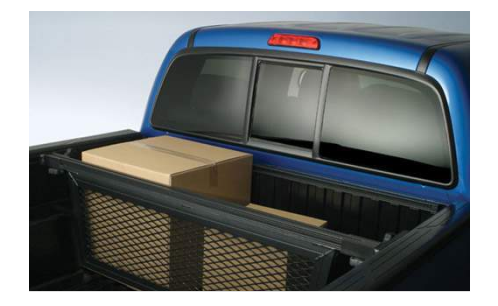
Bed Divider $448.00

The extra large truck bed can be too big sometimes. The cargo divider will allow you to create a smaller partition of your bed space to keep your cargo or boxes from flying around inside your truck bed.