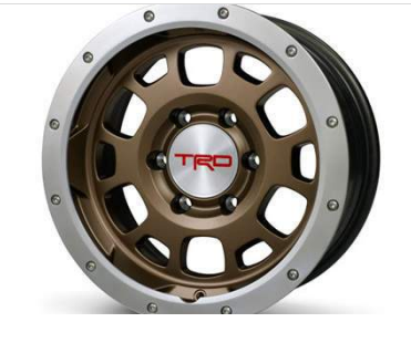
TRD 16" Off-Road Beadlock-Style Alloy Wheels - Bronze $1,796.00

The Toyota Genuine Dash Camera is designed to provide a safe and memorable driving experience in your Toyota vehicle. Safely record the ongoings of the open road while keeping your eyes on the road. Never miss a moment in motion; capture it! The Toyota Genuine Dash Camera will also allow you to record the surroundings of your vehicle while it is parked.