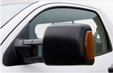
Towing Mirrors - Left Side $375.00

The Towing Mirrors help with visibility by being able to extend 4-in. to provide an even wider rear field of vision. They also feature integrated turn signals to help make your signaling more visible to other drivers.