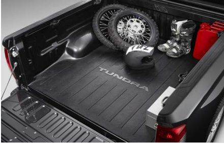
Bed Mat $181.50

Protect your Tundra's bed when you need it. Custom designed for an exact fit, the Bed Mat protects against scratches, spills, and damage. Made from thick cord-reinforced, synthetic rubber for durability, the Bed Mat is resistant to cracking and breaking while providing airflow and drainage to keep the Tundra's bed dry. The anti-slip design also prevents items from sliding around in the bed area.