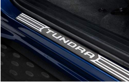
Front Door Sill Protectors $149.00

The Door Sill Protectors help guard against scuffs and scratches. Not only are they functional, but they also provide a styling accent that is immediately noticed when entering the vehicle. Kit of 2 (front).