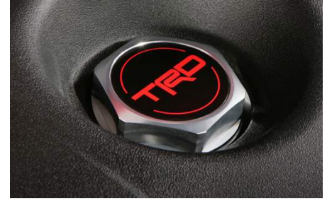
TRD Forged Aluminum Oil Cap $86.50

The Door Sill Protectors help guard against scuffs and scratches. Not only are they functional, but they also provide a styling accent that is immediately noticed when entering the vehicle. Kit of 4 (front and rear).