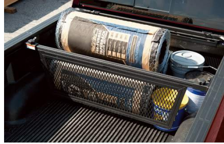
Bed Divider $378.00

The Toyota Genuine Dash Camera is designed to provide a safe and memorable driving experience in your Toyota vehicle. Safely record the on-goings of the open road while keeping your eyes on the road. Never miss a moment in motion; capture it! The Toyota Genuine Dash Camera will also allow you to record the surroundings of your vehicle while it is parked.