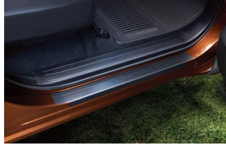
Kit: Door Sill Protectors (front and rear). $137.50

Protect your Tundra's bed when you need it. Custom designed for an exact fit, the Bed Mat protects against scratches, spills, and damage. Made from thick cord-reinforced, synthetic rubber for durability, the Bed Mat is resistant to cracking and breaking while providing airflow and drainage to keep the Tundra's bed dry. The anti-slip design also prevents items from sliding around in the bed area.