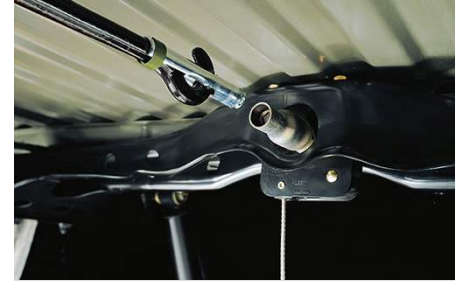
Spare Tire Lock $99.50

The Bed Divider allows you to create a separated partition in your Tundra's bed space, to help keep items from sliding around. The Bed Divider is engineered to work with Tundra's Bed Rails (standard or add-on accessory) and is rated for a 400-lb load capacity. Please note, the Bed Divider accessory cannot be installed in conjunction with the Hard Tri-Fold Tonneau Cover accessory.