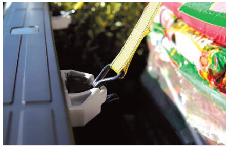
Bed Cleat $70.50

Enhances Tundra's tough, capable stance and helps protect vehicle underbody from damage that can result from flying stones, salt, branches, ice chunks, and other types of road debris. Made from stamped and formed 1/4-in.-thick silver powder-coated aluminum.