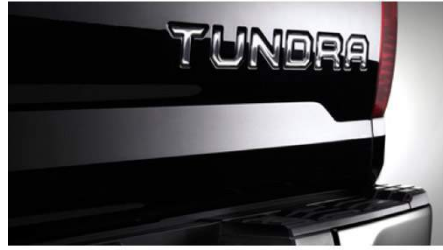
Chrome Tailgate Insert Badge $119.50

•Individual letters fit in the stamped tailgate Tundra logo •Attached with strong 3M adhesive backing •Two colors available: bright chrome and flat black