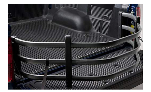
Bed Extender $510.50

Versatile tri-fold design to suit all kinds of cargo needs. - The hard tri-fold tonneau cover adds extra security with five rotary latches, so you can rest assured that your cargo is protected. - This hard trifold tonneau cover is weather-resistant and can fold to the cab for bed access -Meets Toyota's high quality standard