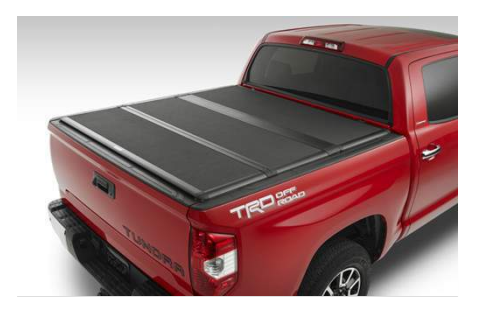
Hard Tri-Fold Tonneau Cover $1,365.00

Protect your Tundra's bed when you need it. Custom designed for an exact fit, the Bed Mat protects against scratches, spills, and damage. Made from thick cord-reinforced, synthetic rubber for durability, the Bed Mat is resistant to cracking and breaking while providing airflow and drainage to keep the Tundra's bed dry. The anti-slip design also prevents items from sliding around in the bed area.