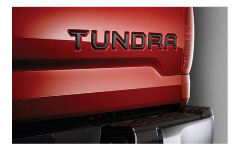
Black Tailgate Insert Badge $119.50

Manufactured from forged, highly polished billet aluminum, the TRD Oil Cap features a red on black TRD logo to customize the engine compartment with a high-tech, race-inspired appearance. It's finished with a high-luster coating to maintain its appearance for years to come.