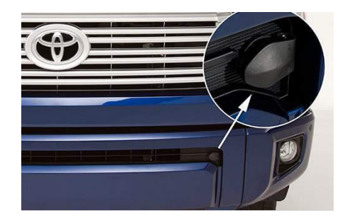
Block Heater $424.50

Guard your vehicle from weathering, UV radiation and road debris that can chip and scratch the finish with 3M Pro Series Genuine Toyota Paint Protection Film. This durable and nearly invisible thermoplastic urethane is designed to protect the hood and front fenders to maintain a like-new appearance. Backed by a 10 year limited warranty.