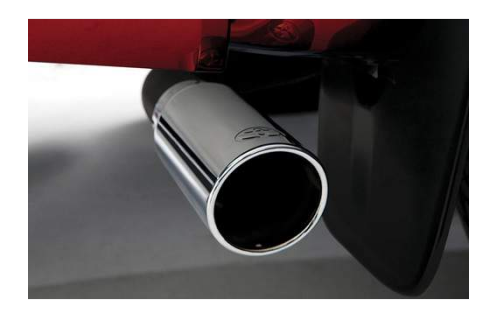
Stainless Steel Exhaust Tip $108.00

Energize the brute within with some deep breathing exercises. The TRD exhaust gives your engine greater power with a less restrictive path, while bellowing out a deep, throaty tone. Made from stainless steel grades, and featuring a cat-back exhaust design with dual TRD logoetched tips. This dual exhaust allows for a less restrictive path, helping reduce backpressure for added low-to mid-range torque, along with improved horsepower.