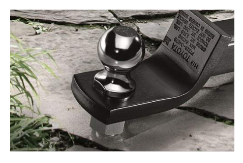
Towing Hitch Ball - 2" - 6,000 lbs $33.50

The Toyota Genuine Dash Camera is designed to provide a safe and memorable driving experience in your Toyota vehicle. Safely record the ongoings of the open road while keeping your eyes on the road. Never miss a moment in motion; capture it! The Toyota Genuine Dash Camera will also allow you to record the surroundings of your vehicle while it is parked.