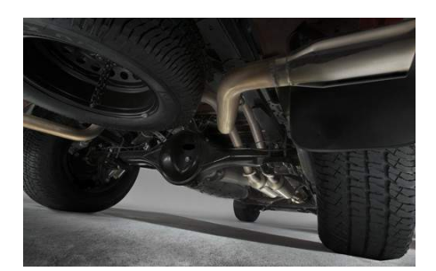
TRD Performance Dual Exhaust System $1,489.00

Provides a convenient, secure stepping platform that makes it easy to get in and out of the truck bed. •Works with tailgate up or down •Hands-free operation allows users to raise or lower the step by nudging with their foot •Stores discreetly under rear bumper •Lightweight, highstrength aluminum die-cast construction features a glass-reinforced nylon step pad with ribbed, nonskid stepping surface •300-lb. load capacity •Weather-resistant black anodized and Teflon® powder-coat finish for long-term durability •Quick and simple no-drill, bolt-on installation