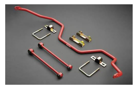
TRD Rear Sway Bar $524.00

Enhance your connection to your Tundra every time you shift with the TRD Shift Knob. Delivers an enhanced shifting feel while providing an impressive addition to your interior.