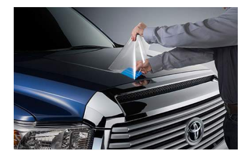
Pro Series Paint Protection Film $440.00

Guard your vehicle from weathering, UV radiation and road debris that can chip and scratch the finish with 3M Pro Series Genuine Toyota Paint Protection Film. This durable and nearly invisible thermoplastic urethane is designed to protect the hood and front fenders to maintain a like-new appearance. Backed by a 10 year limited warranty.