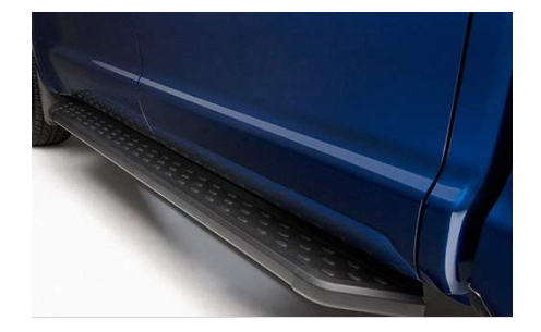
Running Boards $780.00

Secure your spare tire with a precision machined lock constructed of hardened steel with zinc-nickel plating. It quickly attaches to the spare's crank-down tool receiver mechanism, and the key attaches to the crank-down tool in the vehicle's tool kit.