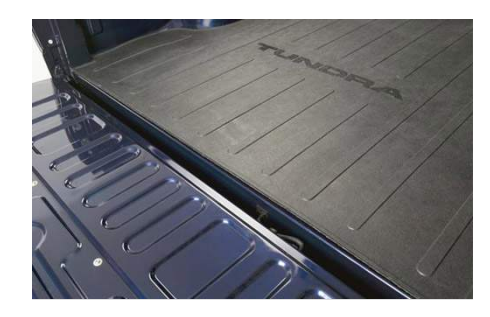
Bed Mat $165.50

Enhances Tundra's tough, capable stance and helps protect vehicle underbody from damage that can result from flying stones, salt, branches, ice chunks, and other types of road debris. Made from stamped and formed 1/4-in.thick silver powder-coated aluminum.