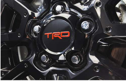
TRD Centre Cap $116.50

Boost the look of your Tundra by adding TRD centre wheel caps for extra ruggedness.