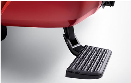
Rear Bumper Step $595.50

Energize the brute within with some deep breathing exercises. The TRD exhaust gives your engine greater power with a less restrictive path, while bellowing out a deep, throaty tone. Made from stainless steel grades, and featuring a cat-back exhaust design with dual TRD logo-etched tips. This dual exhaust allows for a less restrictive path, helping reduce backpressure for added low-to mid-range torque, along with improved horsepower.