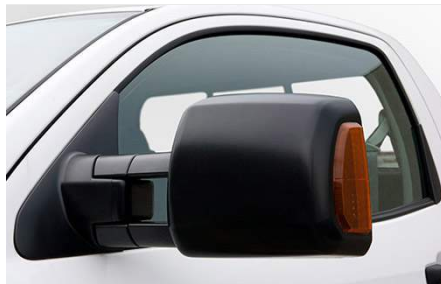
Towing Mirrors - Left Side $375.00

The Door Sill Protectors help guard against scuffs and scratches. Not only are they functional, but they also provide a styling accent that is immediately noticed when entering the vehicle. Kit of 2.