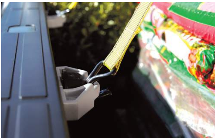
Bed Cleat $70.50

A custom-designed system with 400 watts of heating power not only warms a vehicle up quicker but also reduces engine strain and wear. The heater also saves fuel and battery power during start-ups. With the socket conveniently integrated into the front valence, the Plug-In Block Heater has a factory finished look. It comes with both a main 8-foot and spare 18-inch power supply cord, with a 16-foot cord available separately.