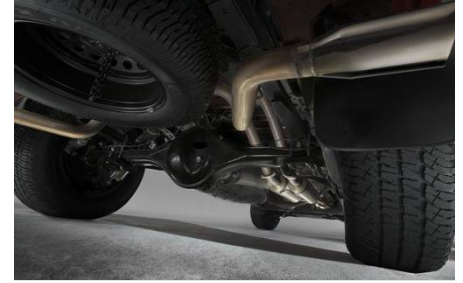
TRD Performance Dual Exhaust System $1,489.00

The Towing Mirrors help with visibility by being able to extend 4-in. to provide an even wider rear field of vision. They also feature integrated turn signals to help make your signaling more visible to other drivers.