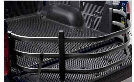
Bed Extender $510.50

Versatile tri-fold design to suit all kinds of cargo needs. - The hard tri-fold tonneau cover adds extra security with five rotary latches, so you can rest assured that your cargo is protected. - This hard tri-fold tonneau cover is weather-resistant and can fold to the cab for bed access - Meets Toyota's high quality standard