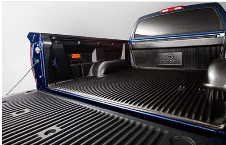
Bed Liner $557.00

Manufactured from forged, highly polished billet aluminum, the TRD Oil Cap features a red on black TRD logo to customize the engine compartment with a high-tech, race-inspired appearance. It's finished with a high-luster coating to maintain its appearance for years to come.