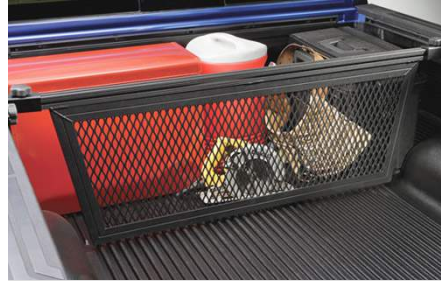
Bed Divider $378.00

The soft tri-fold tonneau cover gives your truck added versatility. Designed and engineered specifically for your Tundra, this low-profile soft tonneau cover is made from lightweight aluminum and the highest-grade vinyl in the industry. Backed by a factory 3-year/60,000km New Vehicle Limited Warranty, and can be incorporated into your vehicle payments.