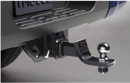
Towing Hitch Ball - 2 5/16" - 14,000 lbs $58.50

The Towing Hitch Ball is designed and tested to meet your vehicle's towing specifications and quality standards.