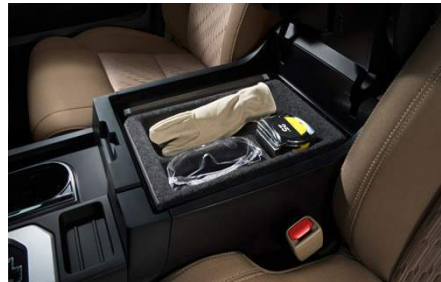
Centre Console Tray $152.50

Provides a convenient, secure stepping platform that makes it easy to get in and out of the truck bed. •Works with tailgate up or down •Hands-free operation allows users to raise or lower the step by nudging with their foot •Stores discreetly under rear bumper •Lightweight, high-strength aluminum die-cast construction features a glass-reinforced nylon step pad with ribbed, nonskid stepping surface •300-lb. load capacity •Weather-resistant black anodized and Teflon® powder-coat finish for long-term durability •Quick and simple no-drill, bolt-on installation