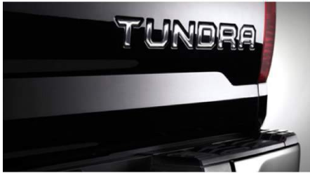
Chrome Tailgate Insert Badge $119.50

• Individual letters fit in the stamped tailgate Tundra logo • Attached with strong 3M adhesive backing • Two colors available: bright chrome and flat black