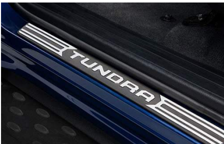
Door Sill Protectors $298.00

Stand out from the crowd and add some additional boldness and premium style to your Tundra with the eye-catching Chrome Accent Package. The package features Toyota quality parts that are designed specifically for Tundra, and includes: chrome mirror caps, chrome door handles*, 5-inch chrome side step bars, and chrome exhaust tip. The Chrome Accent Package is available for Tundra 4X2 and 4X4 Double Cab and CrewMax configurations (except Limited and Platinum grades). This package is a manufacturer installed option ONLY. Please see your Toyota dealer for more information on how to order your Tundra with the Chrome Accent Package. *Only front chrome door handles on Double Cab models are included.