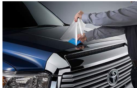
Pro Series Paint Protection Film $440.00

Add functionality with additional Bed Cleats. Designed specifically for the Tundra Bed Rails, they are constructed of sturdy die-cast aluminum, and each fully adjustable Bed Cleat is rated for a maximum load of 220 lb. Sold individually.