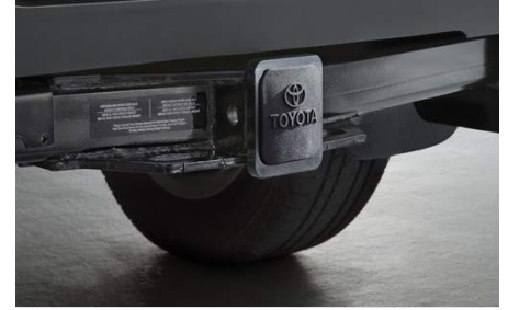
Towing Hitch with Connector (4.6L Models) $747.50

The Toyota Genuine Dash Camera is designed to provide a safe and memorable driving experience in your Toyota vehicle. Safely record the on-goings of the open road while keeping your eyes on the road. Never miss a moment in motion; capture it! The Toyota Genuine Dash Camera will also allow you to record the surroundings of your vehicle while it is parked.