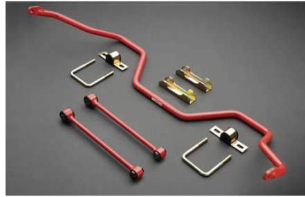
TRD Rear Sway Bar $524.00

Enhance your connection to your Tundra every time you shift with the TRD Shift Knob. Delivers an enhanced shifting feel while providing an impressive addition to your interior.