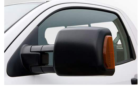
Towing Mirrors - Left Side $375.00

The Door Sill Protectors help guard against scuffs and scratches. Not only are they functional, but they also provide a styling accent that is immediately noticed when entering the vehicle. Kit of 2 (rear).