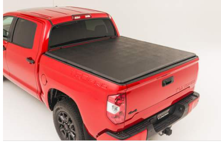
Soft Tri-Fold Tonneau Cover $832.50

The Bed Divider allows you to create a separated partition in your Tundra's bed space, to help keep items from sliding around. The Bed Divider is engineered to work with Tundra's Bed Rails (standard or add-on accessory) and is rated for a 400-lb load capacity. Please note, the Bed Divider accessory cannot be installed in conjunction with the Hard Tri-Fold Tonneau Cover accessory.