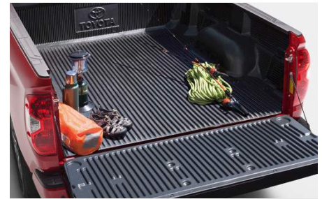
Bed Liner (Accommodates bed rails) $557.00

Manufactured from forged, highly polished billet aluminum, the TRD Oil Cap features a red on black TRD logo to customize the engine compartment with a high-tech, race-inspired appearance. It's finished with a high-luster coating to maintain its appearance for years to come.