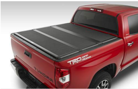
Hard Tri-Fold Tonneau Cover $1,615.00

Keep your oil pure as long as possible, and help enhance the life of your engine, with the TRD Oil Filter that kicks out impurities through a 100% synthetic fiber filtration medium.