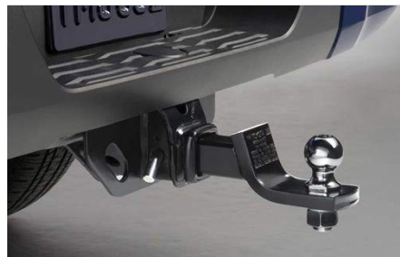
Towing Hitch Ball - 2 5/16" - 14,000 lbs $58.50

The Towing Hitch Ball is designed and tested to meet your vehicle's towing specifications and quality standards.