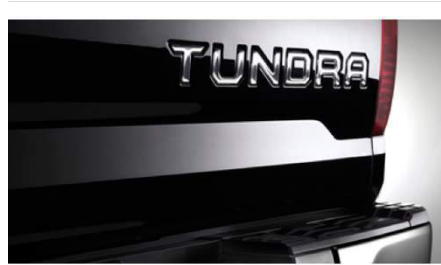
Chrome Tailgate Insert Badge $119.50

The Towing Hitch Ball Platform is custom designed to accommodate the height of the vehicle with conventional towing.