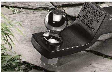
Towing Hitch Ball - 2" - 6,000 lbs $33.50

Specifically engineered for Tundra to obtain the safest maximum tow rating and to meet or exceed all industry towing standards. It is e-coated and powder coated to prevent rust and corrosion.