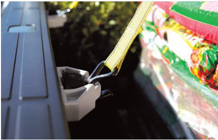
Bed Cleat $70.50

Guard your vehicle from weathering, UV radiation and road debris that can chip and scratch the finish with 3M Pro Series Genuine Toyota Paint Protection Film. This durable and nearly invisible thermoplastic urethane is designed to protect the hood and front fenders to maintain a like-new appearance. Backed by a 10 year limited warranty.