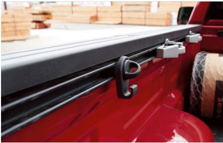
Bed Rail $349.00

Enhances Tundra's tough, capable stance and helps protect vehicle underbody from damage that can result from flying stones, salt, branches, ice chunks, and other types of road debris. Made from stamped and formed 1/4-in.-thick silver powder-coated aluminum.