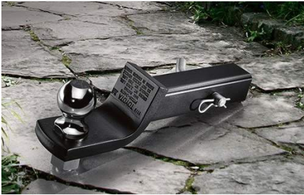
Towing Hitch Ball Platform $116.50

The Towing Hitch Ball Platform is custom designed to accommodate the height of the vehicle with conventional towing.