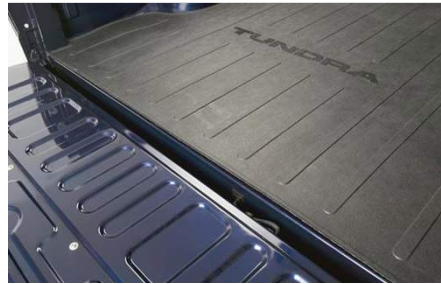
Bed Mat $195.50

Add even more versatility to your Tundra with the Bed Rail system. Galvanized steel construction provides superior strength while black powder coating resists corrosion. The kit includes four die-cast aluminum tie-down Bed Cleats, which are rated for loads up to 880 lb. (220 lb. each). The Bed Rails also allow you to add additional accessories to the Tundra's bed, such as the Bed Divider.