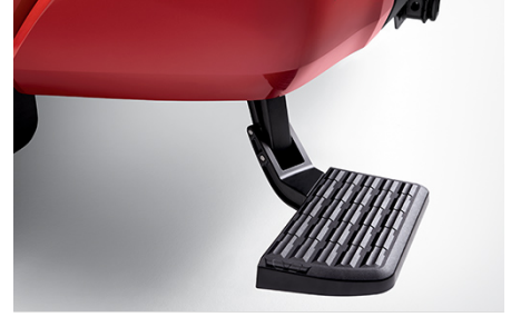
Rear Bumper Step $595.50

Energize the brute within with some deep breathing exercises. The TRD exhaust gives your engine greater power with a less restrictive path, while bellowing out a deep, throaty tone. Made from stainless steel grades, and featuring a cat-back exhaust design with dual TRD logo-etched tips. This dual exhaust allows for a less restrictive path, helping reduce backpressure for added low-to mid-range torque, along with improved horsepower.