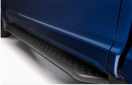
Running Boards $780.01

Not only do the Running Boards assist with entering your Tundra, they also help protect the lower body from road debris. Constructed from highly durable aluminum for corrosion-resistance, they feature a wide-step surface with rubber grommets to help ensure a secure footing. Engineered to mount securely to the Tundra's sides using existing mounting points.