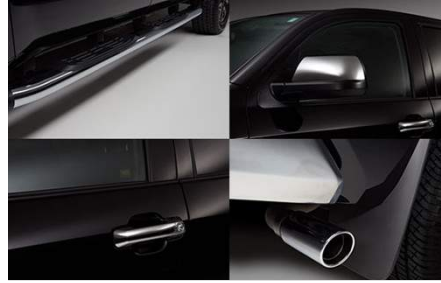
Chrome Accent Package $1,371.00

This TRD sway bar enhances the vehicle's handling characteristics, and provides a more stable cornering stance. It features a gloss red powder coat finish that resists corrosion and protects against road damage, while providing a striking visual enhancement.