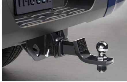
Towing Hitch Ball - 2 5/16" - 14,000 lbs $58.50

The Towing Hitch Ball is designed and tested to meet your vehicle's towing specifications and quality standards.