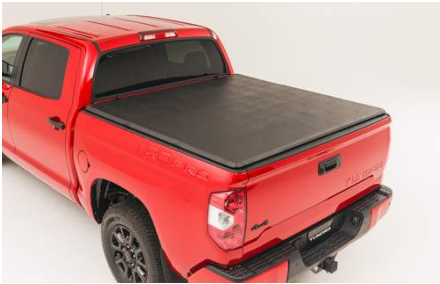
Soft Tri-Fold Tonneau Cover $832.50

The Bed Divider allows you to create a separated partition in your Tundra's bed space, to help keep items from sliding around. The Bed Divider is engineered to work with Tundra's Bed Rails (standard or add-on accessory) and is rated for a 400-lb load capacity. Please note, the Bed Divider accessory cannot be installed in conjunction with the Hard Tri-Fold Tonneau Cover accessory.