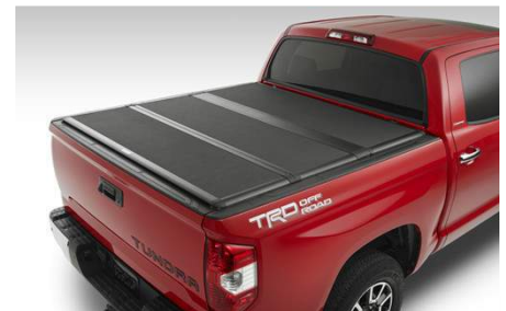
Hard Tri-Fold Tonneau Cover $1,365.00

Enhances Tundra's tough, capable stance and helps protect vehicle underbody from damage that can result from flying stones, salt, branches, ice chunks, and other types of road debris. Made from stamped and formed 1/4-in.-thick silver powder-coated aluminum.