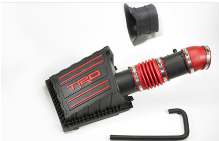
TRD Performance Air Intake System $607.50

Boost the look of your Tundra by adding TRD centre wheel caps for extra ruggedness.