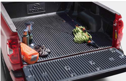
Bed Liner (Accommodates bed rails) $557.00

Manufactured from forged, highly polished billet aluminum, the TRD Oil Cap features a red on black TRD logo to customize the engine compartment with a high-tech, race-inspired appearance. It's finished with a high-luster coating to maintain its appearance for years to come.