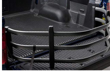
Bed Extender $510.50

Protect your Tundra's bed when you need it. Custom designed for an exact fit, the Bed Mat protects against scratches, spills, and damage. Made from thick cord-reinforced, synthetic rubber for durability, the Bed Mat is resistant to cracking and breaking while providing airflow and drainage to keep the Tundra's bed dry. The anti-slip design also prevents items from sliding around in the bed area.