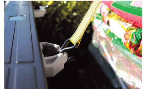
Bed Cleat $70.50

A custom-designed system with 400 watts of heating power not only warms a vehicle up quicker but also reduces engine strain and wear. The heater also saves fuel and battery power during start-ups. With the socket conveniently integrated into the front valance, the Plug-In Block Heater has a factory finished look. It comes with both a main 8-foot and spare 18-inch power supply cord, with a 16-foot cord available separately.