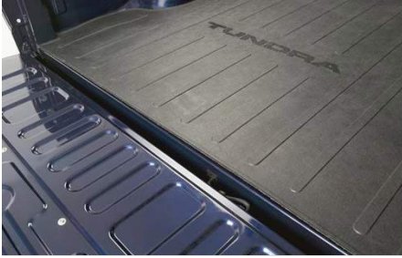
Bed Mat $195.50

Protect your Tundra's bed when you need it. Custom designed for an exact fit, the Bed Mat protects against scratches, spills, and damage. Made from thick cord-reinforced, synthetic rubber for durability, the Bed Mat is resistant to cracking and breaking while providing airflow and drainage to keep the Tundra's bed dry. The anti-slip design also prevents items from sliding around in the bed area.