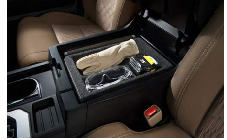
Centre Console Tray $152.50

Provides a convenient, secure stepping platform that makes it easy to get in and out of the truck bed. •Works with tailgate up or down •Hands-free operation allows users to raise or lower the step by nudging with their foot •Stores discreetly under rear bumper •Lightweight, high-strength aluminum die-cast construction features a glass-reinforced nylon step pad with ribbed, nonskid stepping surface •300-lb. load capacity •Weather-resistant black anodized and Teflon® powder-coat finish for long-term durability •Quick and simple no-drill, bolt-on installation