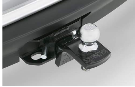
Towing Hitch Ball 2" - 6,000 lbs $33.50

A custom-designed system with 400 watts of heating power not only warms a vehicle up quicker but also reduces engine strain and wear. The heater also saves fuel and battery power during start-ups. With the socket conveniently integrated into the front valance, the Plug-In Block Heater has a factory finished look. It comes with both a main 8-foot and spare 18-inch power supply cord, with a 16-foot cord available separately.