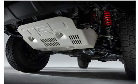
TRD Skid Plate $541.25

The Toyota Genuine Dash Camera is designed to provide a safe and memorable driving experience in your Toyota vehicle. Safely record the on-goings of the open road while keeping your eyes on the road. Never miss a moment in motion; capture it! The Toyota Genuine Dash Camera will also allow you to record the surroundings of your vehicle while it is parked.