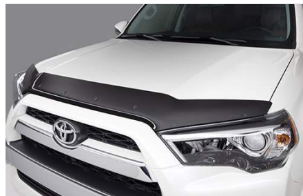
Hood Deflector $219.50

The Cargo Net has hammock-style netting with elastic closure. This flexible and stretchable, nylon-braided net secured by tie-down rings in the rear cargo area prevents items from shifting around while on the road. Easy to install, and remove when not in use.