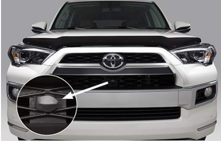
Plug-In Block Heater $441.00

A custom-designed system with 400 watts of heating power not only warms a vehicle up quicker but also reduces engine strain and wear. The heater also saves fuel and battery power during start-ups. With the socket conveniently integrated into the front valance, the Plug-In Block Heater has a factory finished look. It comes with both a main 8-foot and spare 18-inch power supply cord, with a 16-foot cord available separately.