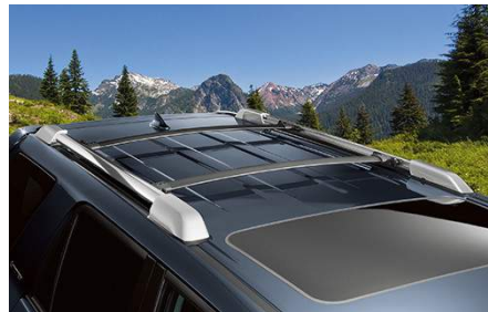
Cross Bars $322.50

Manufactured from forged, highly polished billet aluminum, the TRD Oil Cap features a red on black TRD logo to customize the engine compartment with a high-tech, race-inspired appearance. It's finished with a high-luster coating to maintain its appearance for years to come.