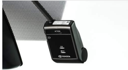
Toyota Genuine Dash Camera $648.00

Enhance your connection to your 4Runner every time you shift with the TRD Shift Knob. Delivers an enhanced shifting feel while providing an impressive addition to your interior.