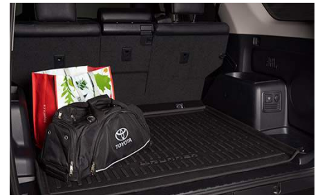
Cargo Liner $166.50

Engineered for seamless integration with 4Runner's factory roof rails, this set of two Cross Bars enhances 4Runner's cargo management, versatility and provides additional tie-down points for all types of cargo. Load capacity is 60 kg when evenly distributed across both bars.