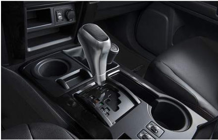
TRD Shift Knob $191.50

Enhance your connection to your 4Runner every time you shift with the TRD Shift Knob. Delivers an enhanced shifting feel while providing an impressive addition to your interior.