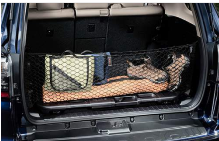
Cargo Net $76.50

Toyota START+ long range remote engine starter enables you to start your Toyota from 800 meters or 2,600 feet away (unobstructed). Toyota START+ activates your pre-set heating and air conditioning system, as well as your front and rear defoggers. Non-Genuine remote engine starters and any damages or failures resulting from installation and use, are not covered by any Toyota warranty. Only the Genuine Toyota START+, is covered by Toyota warranty. All Non-Genuine remote engine starter installation is hostile and requires cutting, splicing and soldering of wires and/or require an additional immobilizer bypass device. All features may not be applicable to all vehicle models.