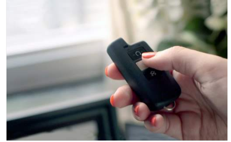
START+ Long Range Remote Engine Starter $814.45

The Toyota Towing Hitch Ball is designed and tested to meet your Toyota's towing specification and quality standards.