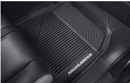
Tub Style All Season Floor Mats (Front and Rear) $166.50

The Towing Hitch Ball is designed and tested to meet Highlander and Highlander Hybrid's towing specifications and quality standards. It works seamlessly with the accessory Towing Hitch.