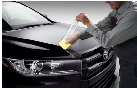
Pro Series Paint Protection Film $440.00

Designed and engineered to work with the Toyota Genuine Towing Hitch, the Ball Platform is built and tested to meet your Highlander or Highlander Hybrid's exact towing capacity. Its placement has been optimized to maintain the proper vehicle departure angle.