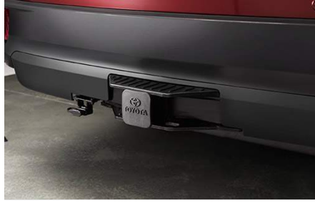
Towing Hitch with Wire Harness $993.00

Made from thick high-grade tinted acrylic, the Hood Deflector offers high impact resistance and reduces the potential damage to your hood from road debris. The stylish wraparound design complements the vehicle's appearance while providing extra side protection.