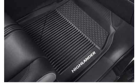
Tub Style All Season Floor Mats (Front and Rear) $166.50

The Towing Hitch Ball is designed and tested to meet Highlander and Highlander Hybrid's towing specifications and quality standards. It works seamlessly with the accessory Towing Hitch.