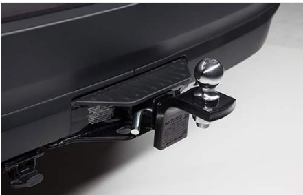
Towing Hitch Ball Platform $96.50

Not only do Running Boards assist with entering a vehicle, they also help protect the lower body from road debris. The Running Boards feature a stainless steel finish with a raised-rubber pattern to help ensure secure footing when entering and exiting the vehicle. Designed exclusively for Highlander and Highlander Hybrid, the Running Boards seamlessly integrate with the vehicle's new dynamic and stylish exterior look.