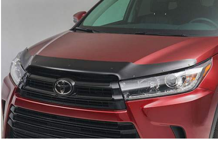
Hood Deflector $212.50

Made from thick high-grade tinted acrylic, the Hood Deflector offers high impact resistance and reduces the potential damage to your hood from road debris. The stylish wraparound design complements the vehicle's appearance while providing extra side protection.