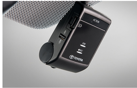
Toyota Genuine Dash Camera $615.00

A custom-designed system with 400 watts of heating power not only warms a vehicle up quicker but also reduces engine strain and wear. The heater also saves fuel and battery power during start-ups. With the socket conveniently integrated into the front valance, the Plug-In Block Heater has a factory finished look. It comes with both a main 8-foot and spare 18-inch power supply cord, with a 16-foot cord available separately.