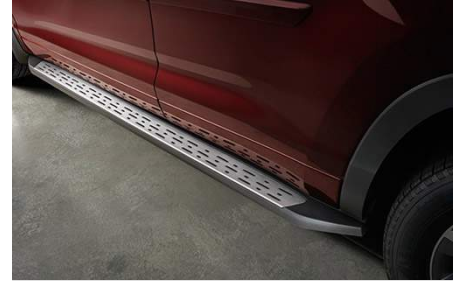
Running Boards $962.00

The Towing Hitch system is specifically designed and manufactured for Highlander and Highlander Hybrid models, and has been engineered to obtain the vehicle's safest maximum tow rating. The included Towing Hitch Wire Harness with 4 pin flat connector seamlessly integrates with Highlander and Highlander Hybrid's electrical system. All Toyota Genuine Hitch systems are e-coated and powder coated to prevent rust and corrosion and they are designed to meet or exceed all industry towing standards.