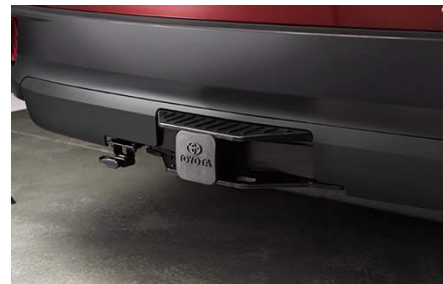
Towing Hitch with Wire Harness $993.00

Designed and engineered to work with the Toyota Genuine Towing Hitch, the Ball Platform is built and tested to meet your Highlander or Highlander Hybrid's exact towing capacity. Its placement has been optimized to maintain the proper vehicle departure angle.