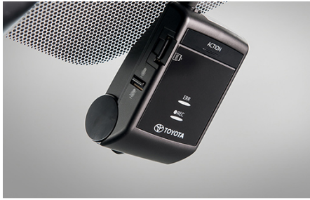
Toyota Genuine Dash Camera $615.00

The Toyota Genuine Dash Camera is designed to provide a safe and memorable driving experience in your Toyota vehicle. Safely record the on-goings of the open road while keeping your eyes on the road. Never miss a moment in motion; capture it! The Toyota Genuine Dash Camera will also allow you to record the surroundings of your vehicle while it is parked