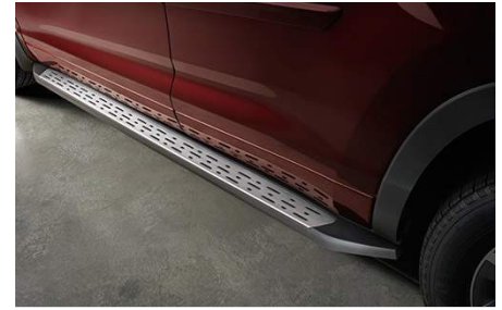
Running Boards $962.00

Made from thick high-grade tinted acrylic, the Hood Deflector offers high impact resistance and reduces the potential damage to your hood from road debris. The stylish wraparound design complements the vehicle's appearance while providing extra side protection.