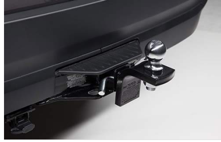
Towing Hitch Ball Platform $96.50

The Cargo Net features hammock-style netting with elastic closure. This flexible and stretchable, nylon-braided net secured by tie-down rings in Highlander and Highlander Hybrid's rear cargo area prevents items from shifting around while on the road. Easy to install, and remove when not in use.