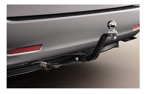
Towing Hitch, Ball Platform & Wire Harness $892.00

Built to meet Toyota's high quality standards for performance and strength, the cross bars are designed to install with ease and can be easily adjusted with no tools necessary. (Loading capacity 150lbs).