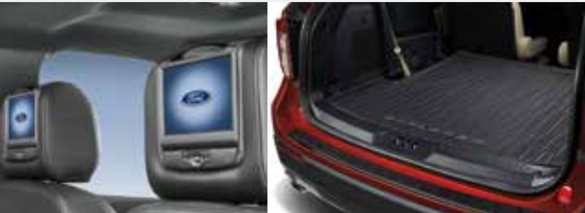
Rear seat entertainment systems 1 1 Ford Licensed Accessory.