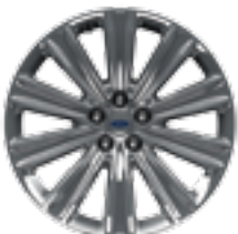
20" HAND-POLISHED ALUMINUM Available

CONNECTIVITY & ENTERTAINMENT B&O Sound System with 12 speakers and HD Radio™ Technology