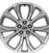
20" POLISHED ALUMINUM 3 Available

Available equipment shown, including roof-mounted kayak carrier 5 by Yakima® 1 Additional charge. 2 Metallic. 3 Restrictions may apply. See your dealer for details. 4 Certain restrictions, 3rd-party terms and data rates may apply. See footnote 1 on the “Your Tech, Your Way” pages, and your Ford Dealer for details. 5 Ford Licensed Accessory.