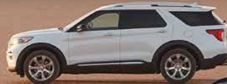
PLATINUM | Available 21" Premium Aluminum Wheels