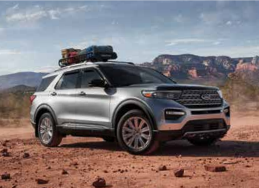
Limited in Iconic Silver accessorized with hood deflector, side window deflectors, 1 front and rear molded splash guards, roof crossbars, 2 and roof-mounted cargo basket 1,2