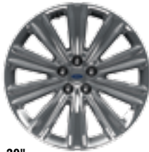
20" HAND-POLISHED ALUMINUM Standard