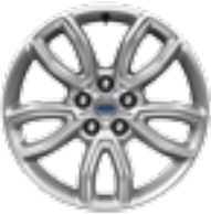
18" PAINTED ALUMINUM Standard