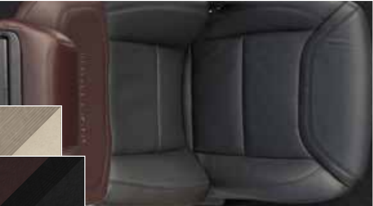
LEATHER-TRIMMED SEATING SURFACES: Light Sandstone, Ebony/Brunello

OPTIONS Premium Technology Package: Multicontour front seats with Active Motion, 10.1" LCD Capacitive Portrait Touchscreen in center stack, and B&O Sound System with 14 speakers and HD Radio™ Technology 2nd-row 40/20/40 split fold-flat seat with E-Z Entry, recline, and heated outboard seats Black roof-rack crossbars Dual-Headrest Rear Seat Entertainment System 3 Wheel lock kit Also see “Available Options for All Models” on the Explorer specifications page.