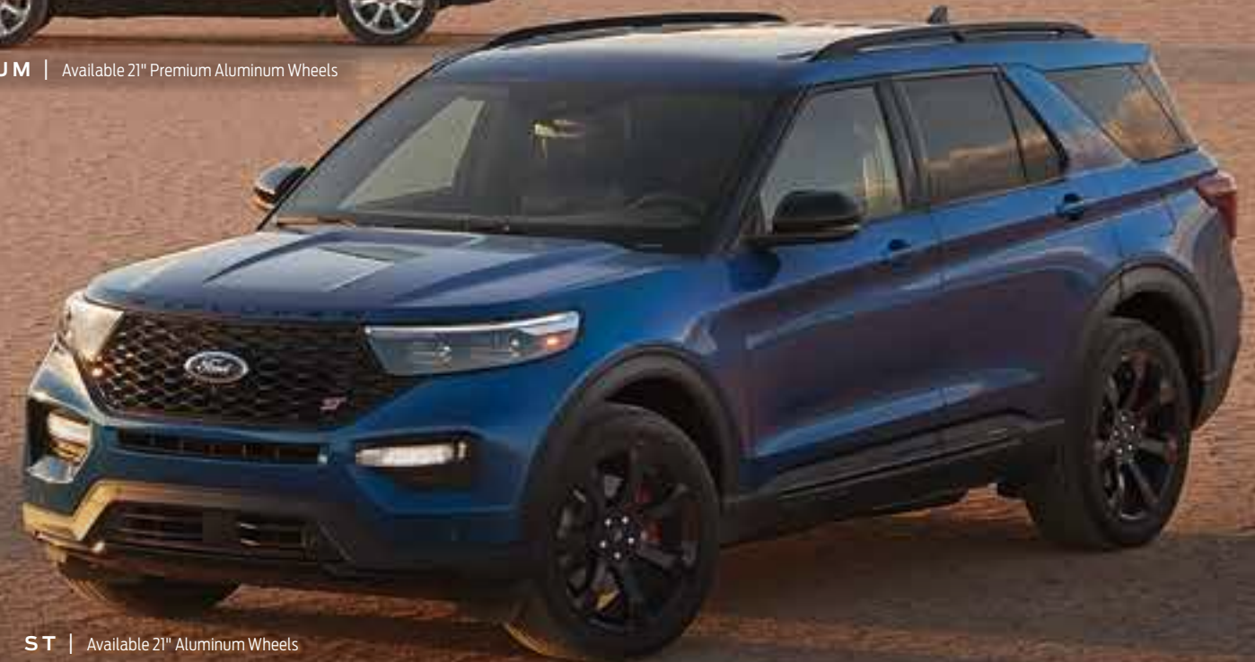
ST | Available 21" Aluminum Wheels