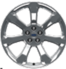
21" PREMIUM ALUMINUM Available

COMFORT & CONVENIENCE 1st- and 2nd-row premium carpeted floor mats with Platinum badging Luxury leather-trimmed 1st- and 2nd-row seating surfaces with Tri-Diamond perforated inserts and “PLATINUM” embroidery Power-folding, power, heated sideview mirrors with autofold, LED turn signal indicators, security approach lamps, memory, and driver’s side auto-dimming feature Remote control 1st-row windows and moonroof Twin-panel moonroof