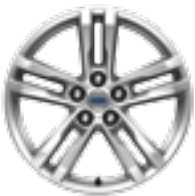
18" 5-SPOKE SPARKLE SILVER-PAINTED ALUMINUM Standard

Also see “Available Options for All Models” on the Explorer specifications page.