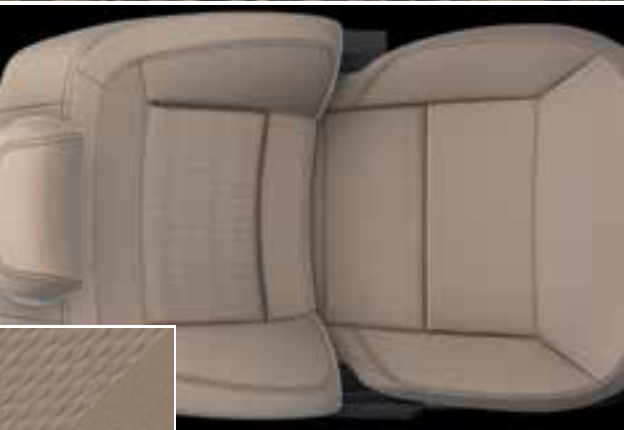
CLOTH SEATING SURFACES: Sandstone