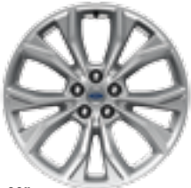
20" POLISHED ALUMINUM Standard

COMFORT & CONVENIENCE 1st-row heated/ventilated seats, 10-way power passenger seat, and driver’s side memory 2nd-row heated seats with E-Z Entry 2nd-row sunblinds 3rd-row PowerFold® seat 12V powerpoints (3) Ambient lighting Auto-dimming rearview mirror Hands-free, foot-activated liftgate Heated steering wheel with power-tilt/-telescoping column Leather-trimmed 1st- and 2nd-row seating surfaces with micro-perforated inserts Power-folding, power, heated sideview mirrors with autofold, LED turn signal indicators, security approach lamps, and memory Remote Start System Windshield wiper de-icer Wireless charging pad and 110V/150W AC power outlet