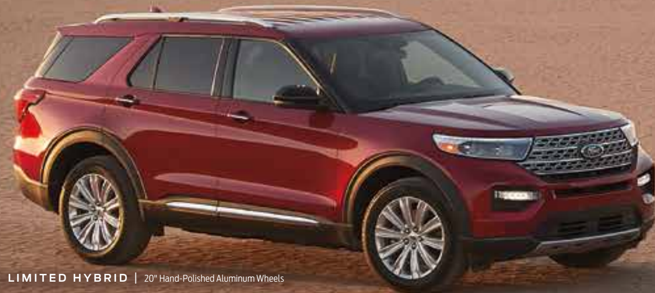
LIMITED HYBRID | 20" Hand-Polished Aluminum Wheels