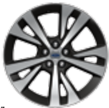
20" BRIGHT MACHINED-FACE ALUMINUM Standard