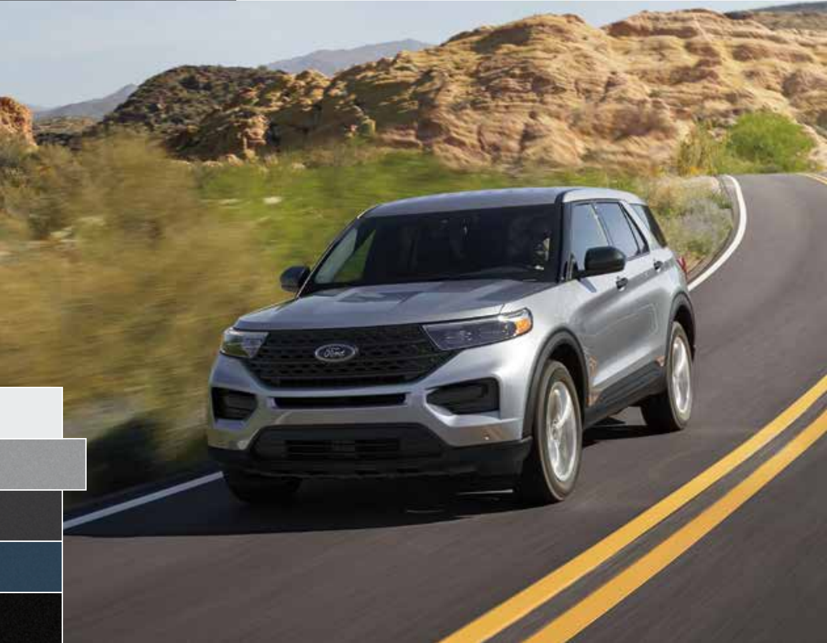
COLORS: Oxford White, Iconic Silver, 5 Magnetic, 5 Blue, 5 Agate Black 5

If you need room for the whole crew, Explorer seats up to 7 passengers in sophisticated style. A standard power liftgate makes for convenient loading/unloading of gear, while FordPass Connect™ with 4G LTE Wi-Fi hotspot capability lets you – and the crew – stay connected on the road. Ford Co-Pilot360™ and Side-Wind Stabilization help increase your confidence the moment you leave. In RWD or available 4WD, 300 hp 2 and 3,000 lbs. of max. towing capacity 3 give you the power you need. Explorer is the all-time best-selling SUV in America, 4 and the all-new Explorer is better than ever.