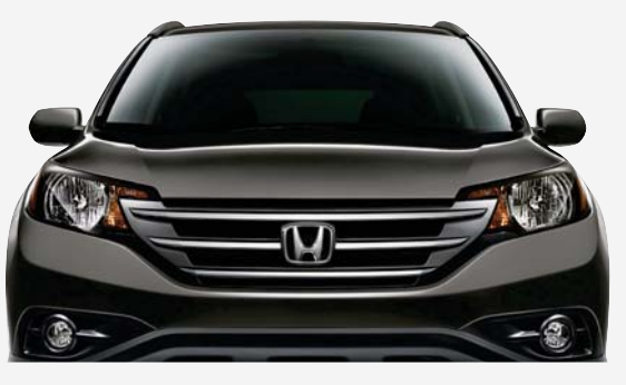
URBAN TITANIUM METALLIC