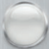
SNOW WHITE PEARL (HEV, PHEV)