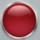
RUNWAY RED (HEV)

Actual colors may vary from printed brochure. See kia.com/optima-hybrids for interior combinations.