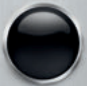
AURORA BLACK PEARL (HEV, PHEV)