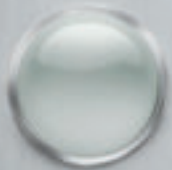
ALUMINUM SILVER (PHEV)