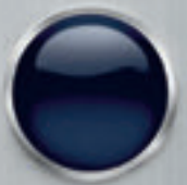
GRAVITY BLUE (HEV, PHEV)