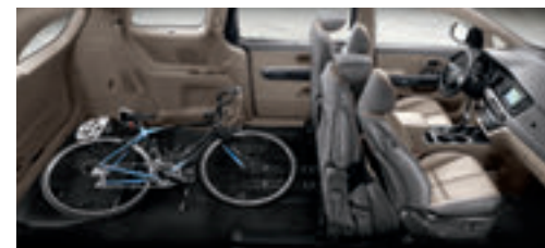
SLIDE-N-STOW® 2ND ROW & 3RD ROW STOWED 13