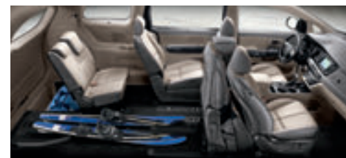
SLIDE-N-STOW® SPLIT 2ND ROW & SPLIT 3RD ROW STOWED 13

*Optional feature available only on certain trims. See kia.com for details. 11, 13 See inside back cover for endnotes. SX SHOWN