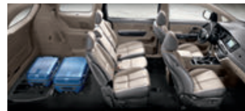
FOLD-IN-THE-FLOOR 3RD-ROW SEATS 13