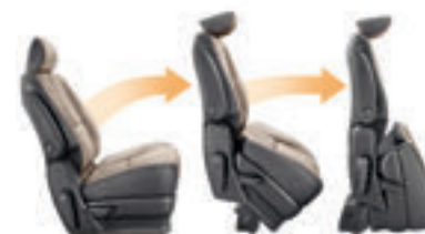
2ND-RROW SLIDE-N-STOW® SEAT DESIGN