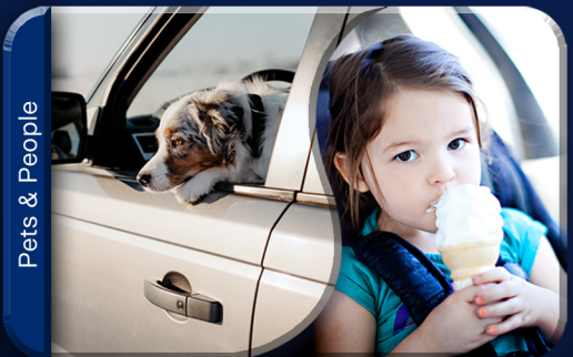
Pets & People