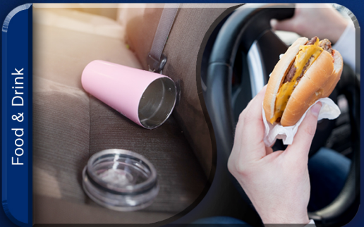
Food & Drink