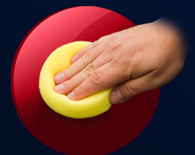
Zurich Shield Premier reapplied