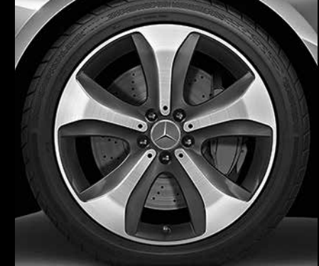
19" 5-SPOKE ALLOY WHEEL Finish: Tremolite metallic, polished