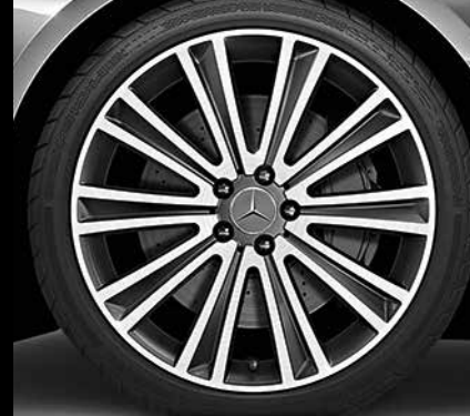
20" 10-SPOKE WHEEL Finish: Palladium silver metallic, polished

From bikes and snowboards to skis and cargo containers, easily attach a wide assortment of items to the top of your S-Class.