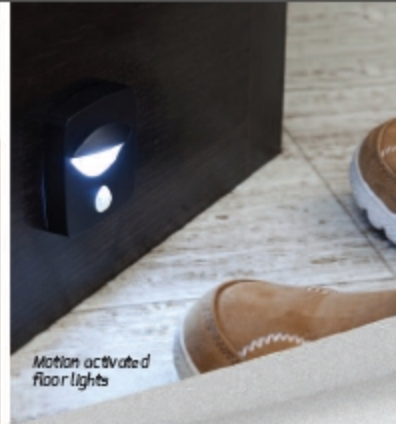
Motion activated floor lights