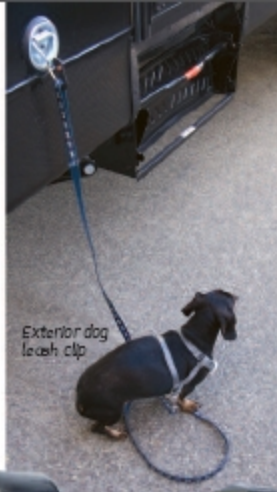
Exterior dog leash clip