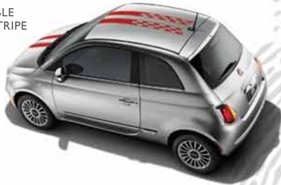
RED DOUBLE RACING STRIPE