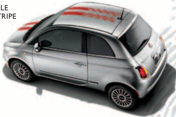
RED DOUBLE RACING STRIPE