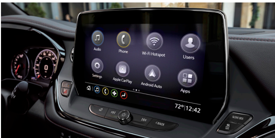
STANDARD 10.2-INCH-DIAGONAL COLOR TOUCHSCREEN