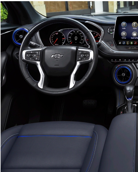
HEATED FRONT SEATS NOW STANDARD ON ALL MODELS