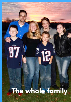
The whole family