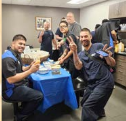
#NationalAutomotiveServiceProfessionalsDay, we celebrated our technicians with bagels from Panera Bread to say thank you for their hard work.