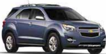
Twilight Blue Metallic 2