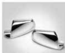
Chrome Outside Mirrors