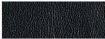
Jet Black Leather Appointments 6