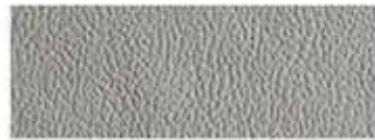
Light Titanium-Color Leather Appointments 6