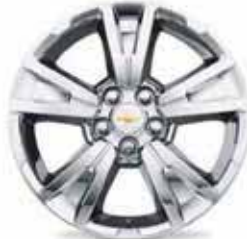
19" Chrome-Clad Aluminum Wheel (available on LTZ; requires V6 engine)