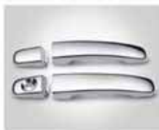
Chrome Door Handles