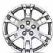
19" Chrome Wheel

PERSONALIZE YOUR EQUINOX AT CHEVY.COM/ACCESSORIES