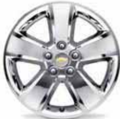
18" Chrome-Clad Aluminum Wheel (available on 2LT/LTZ)