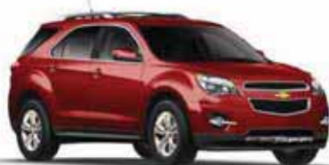
Crystal Red Tintcoat 1,2,3