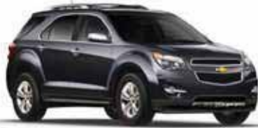
Black Granite Metallic 1,2