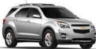
Silver Ice Metallic