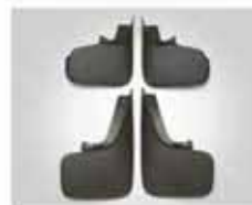
Custom Molded Splash Guards, Front and Rear