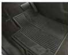
All-Weather Floor Mats, Front and Rear