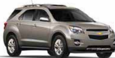
Mocha Steel Metallic 3