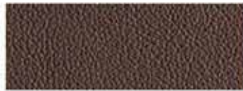
Brownstone Leather Appointments 6