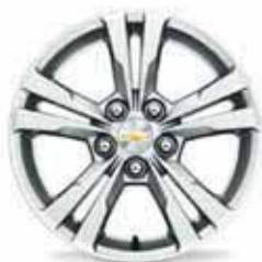
17" Aluminum Wheel (standard on all models)