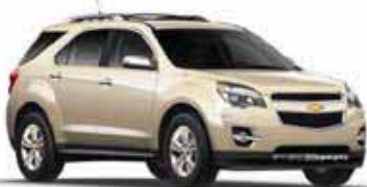
Gold Mist Metallic