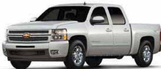
Silver Ice Metallic 5