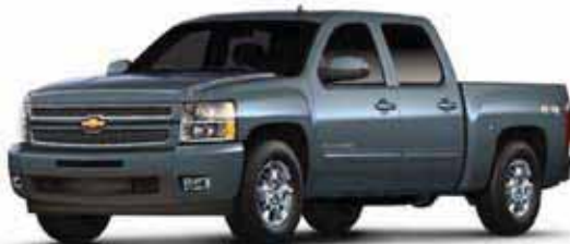
Blue Granite Metallic