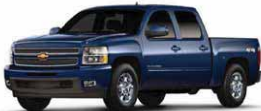
Imperial Blue Metallic 2