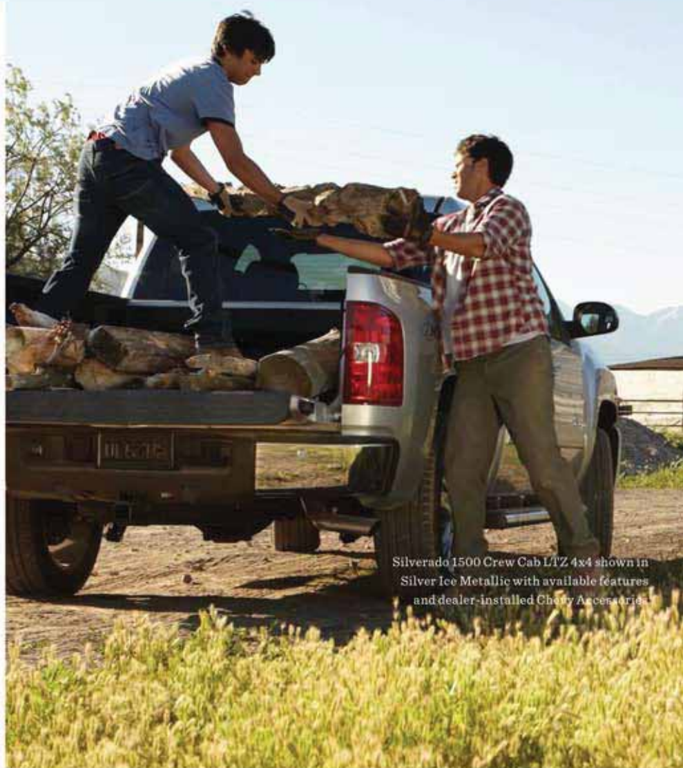
Silverado 1500 Crew Cab LTZ 4x4 shown in Silver Ice Metallic with available features and dealer-installed Chevy Accessories.