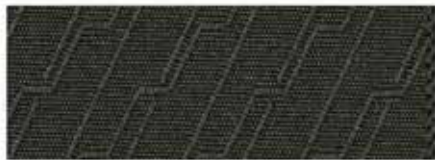
Ebony Cloth 4