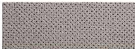
Light Titanium-Color Perforated- Leather Appointments 5