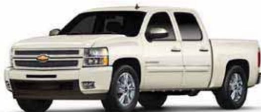
White Diamond Tricoat 6