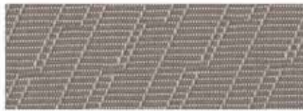
Light Titanium-Color Cloth 5