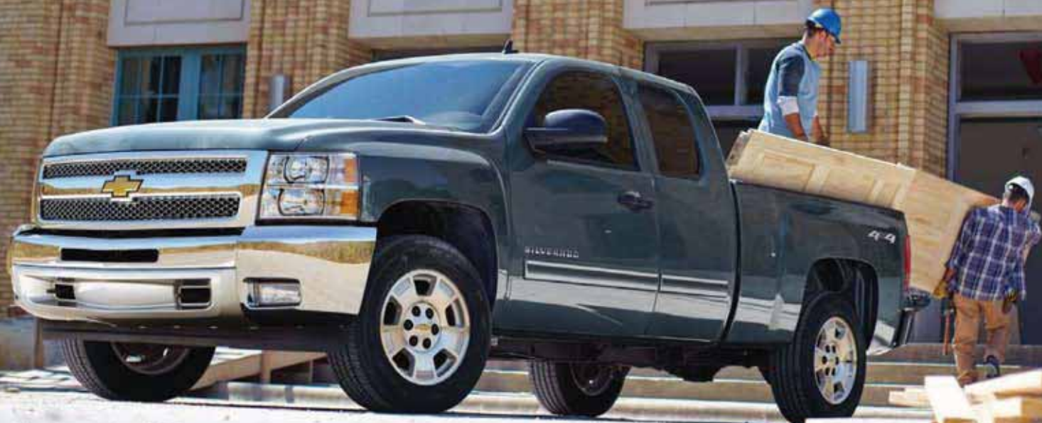
Silverado 1500 Extended Cab All-Star Edition 4x4 shown in Blue Granite Metallic with available features.

Silverado Extended Cab rear doors swing open a full 170 DEGREES —the widest of any full-size pickup.