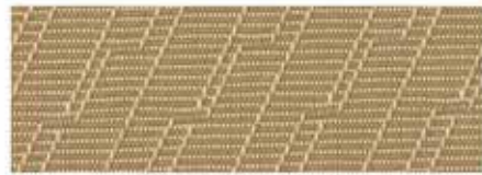
Light Cashmere-Color Cloth 3