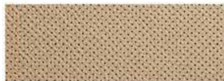
Light Cashmere-Color Perforated- Leather Appointments 3