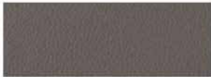
Dark Titanium-Color Vinyl 2