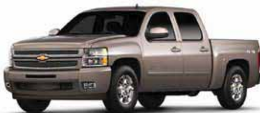
Mocha Steel Metallic 3