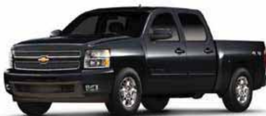
Black Granite Metallic 1