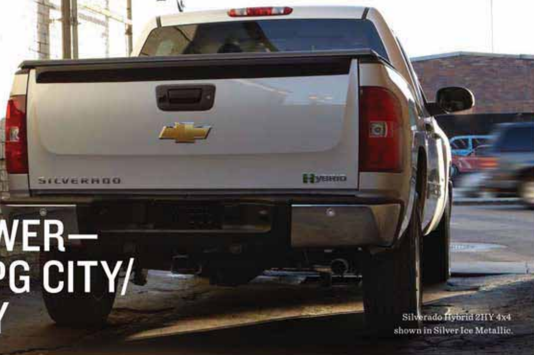
Silverado Hybrid 2HY 4x4 shown in Silver Ice Metallic.

When you develop the SILVERADO HYBRID 1 —AMERICA'S FIRST TWO-MODE HYBRID PICKUP —you want to put up the numbers. Silverado Hybrid offers an EPA-estimated 20 MPG city/23 highway—that's CITY FUEL ECONOMY UNSURPASSED BY THE 6-CYLINDER HONDA ACCORD 2 . But what really counts is how Silverado Hybrid performs under demanding conditions. With 332 HORSEPOWER, 367 LB.-FT. OF TORQUE , up to 6,100 lbs. of towing power (2WD) 3 and a payload capacity of up to 1,527 lbs. (2WD). 4