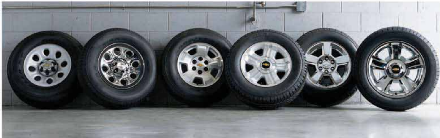
17" Steel Wheel