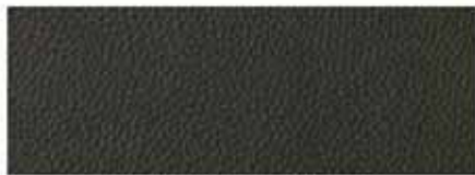
Ebony Leather Appointments 4