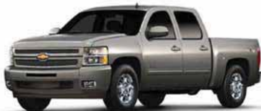
Graystone Metallic 4