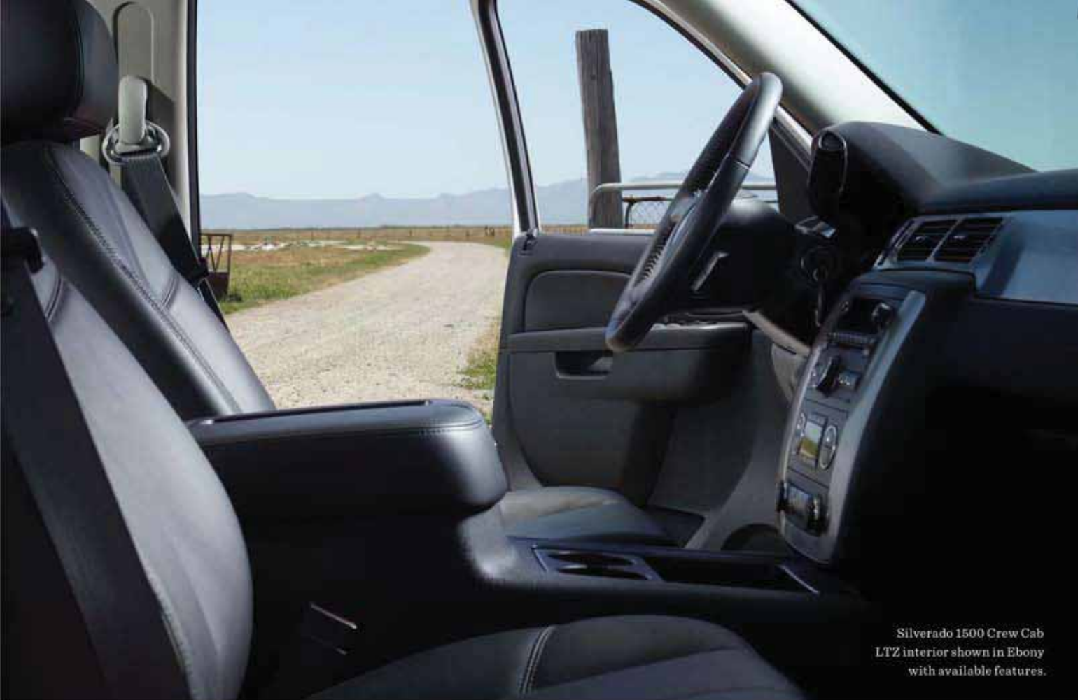
Silverado 1500 Crew Cab LTZ interior shown in Ebony with available features.