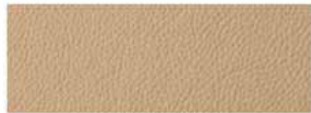
Light Cashmere-Color Leather Appointments 3