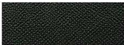
Ebony Perforated-Leather Appointments 4