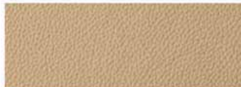
Light Cashmere-Color Leather Appointments 5