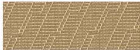
Light Cashmere-Color Cloth 4