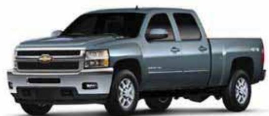
Blue Granite Metallic