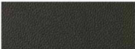
Ebony Leather Appointments 5