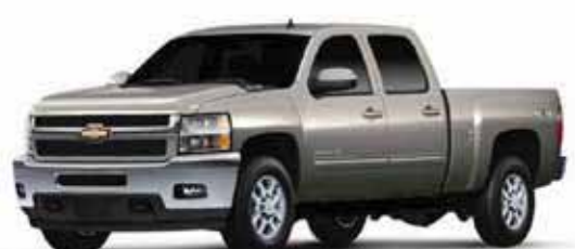
Graystone Metallic 1