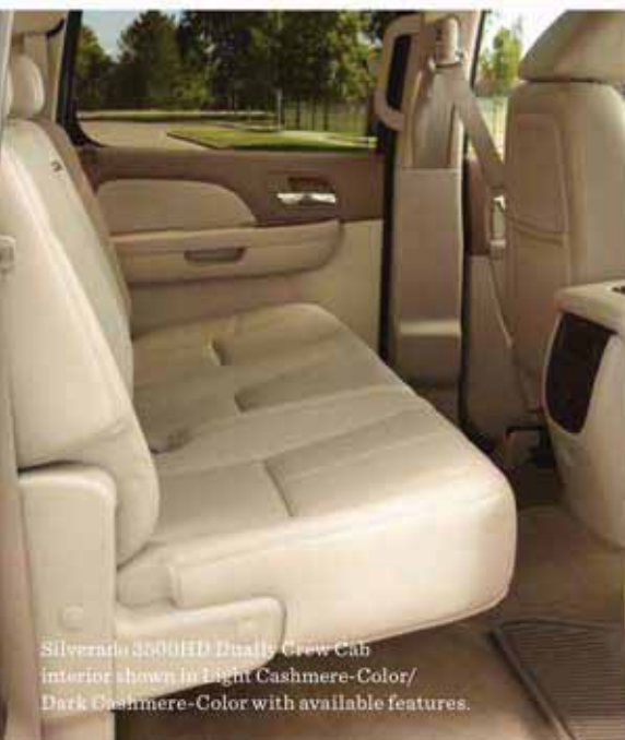
Silverado 3500HD Dually Crew Cab interior shown in Light Cashmere-Color/ Dark Cashmere-Color with available features.

Heated, leather-appointed front bucket seats with 10-way power adjusters Available power-adjustable pedals Remote vehicle starter system Choice of Ebony, Light Cashmere-Color or Light Titanium-Color interiors Dual-zone automatic climate controls