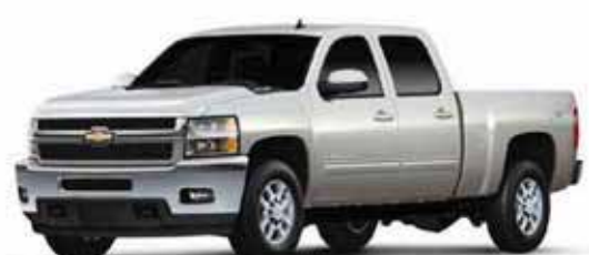
Silver Ice Metallic