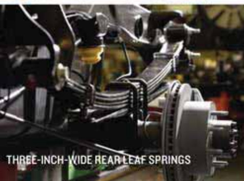
THREE-INCH-WIDE REAR LEAF SPRINGS