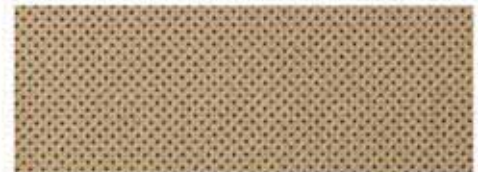
Light Cashmere-Color Perforated- Leather Appointments 6