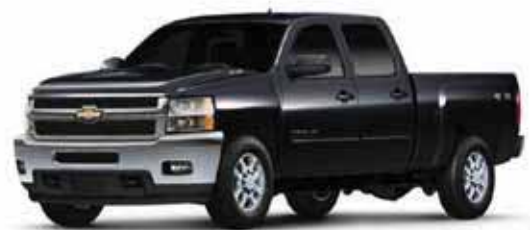
Black Granite Metallic 1