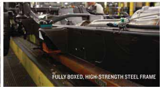
FULLY BOXED, HIGH-STRENGTH STEEL FRAME