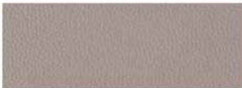
Light Titanium-Color Leather Appointments 5