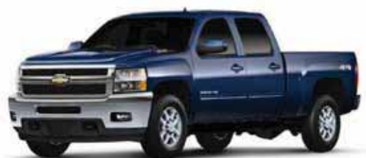
Imperial Blue Metallic 1