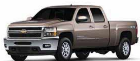
Mocha Steel Metallic 1