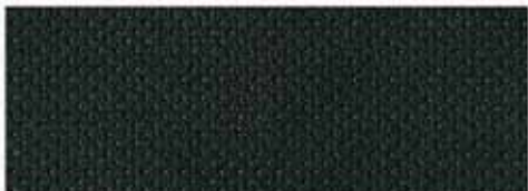
Ebony Perforated-Leather Appointments 6