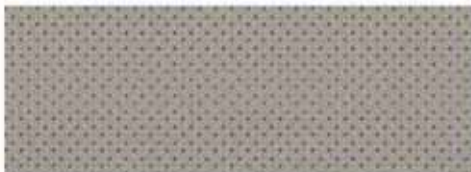
Light Titanium-Color Perforated- Leather Appointments 6