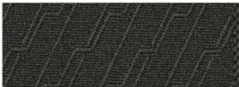
Ebony Cloth 3