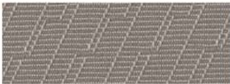
Light Titanium-Color Cloth 4