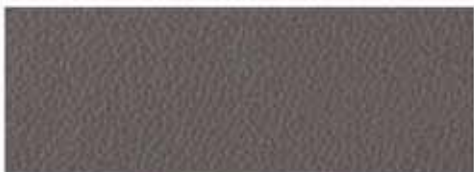
Dark Titanium-Color Vinyl 2